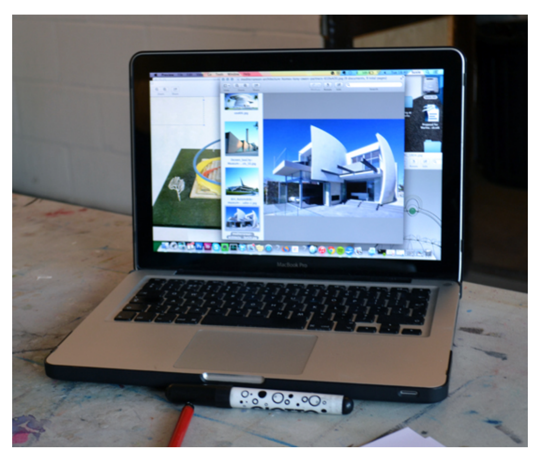
Inspirational images as a starting point from Susie Olczak's 'Studio Workshop' for teenagers from AccessArt's Experimental Drawing Class

<u>Serpentine Gallery</u> in Hyde park each summer for inspiration. I kept the introduction as brief as possible in order to keep the pace fast and exciting and so the students had freedom to explore without me dictating what they should do.