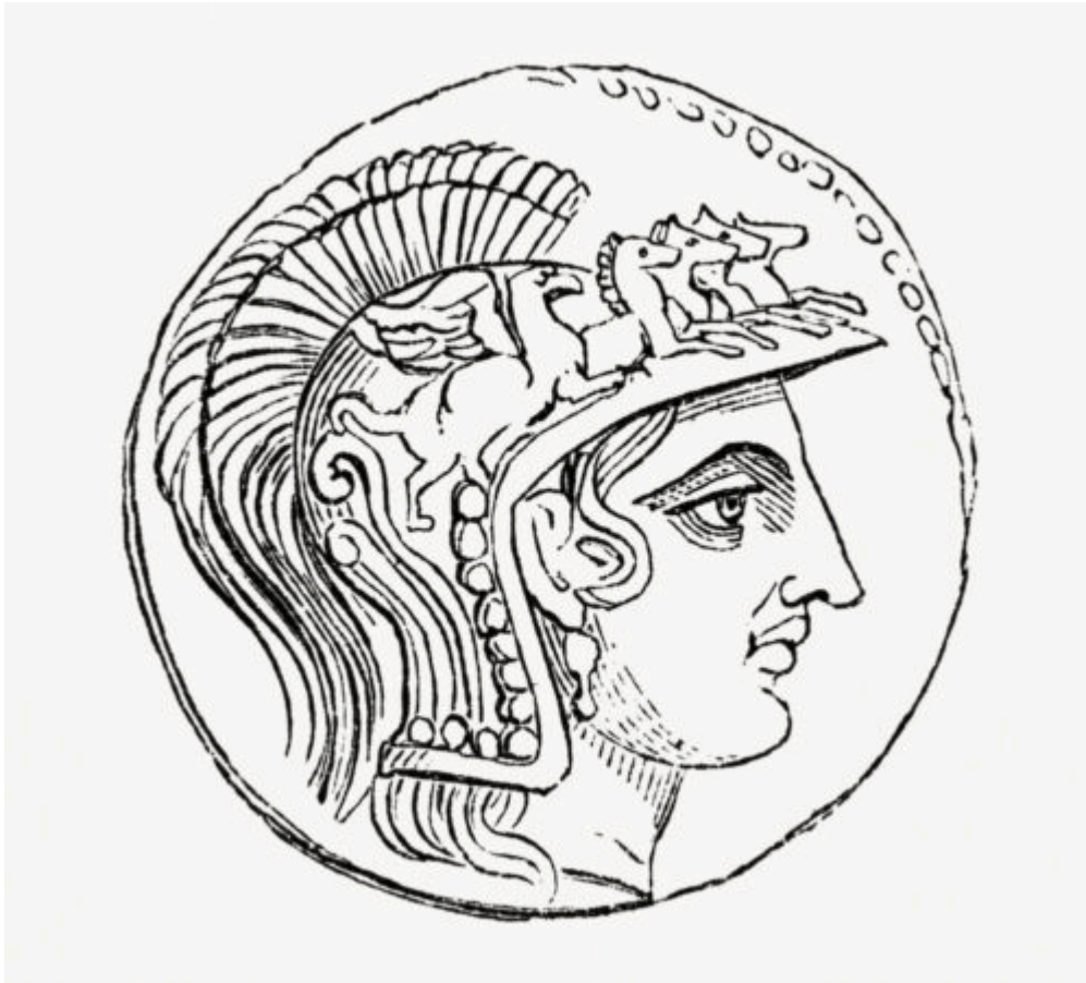
Side Portrait of a Greek Military Male (1862) from Gazette Des Beaux-Arts, a French art review.