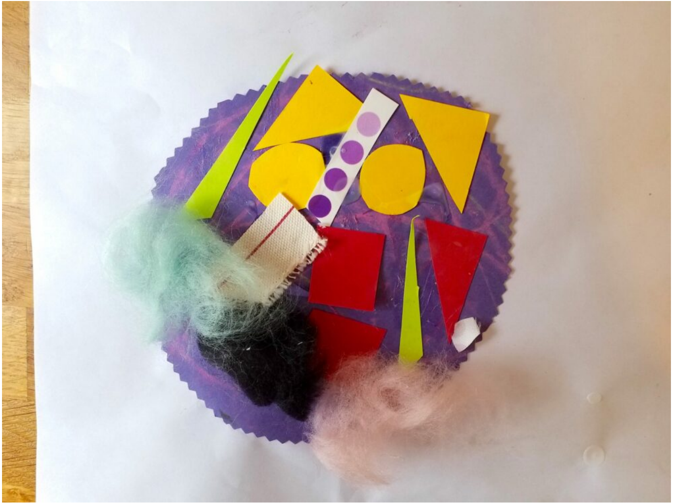
The finished 'Angry Cat' face.

We carried out the same process to make a contrasting 'Calm Cat'. We made smoother, curved 'calm' marks, followed by creating a softer cat fur textured drawing. We cut out a face and shapes from these expressive drawings and glued on 'calm' material scraps.