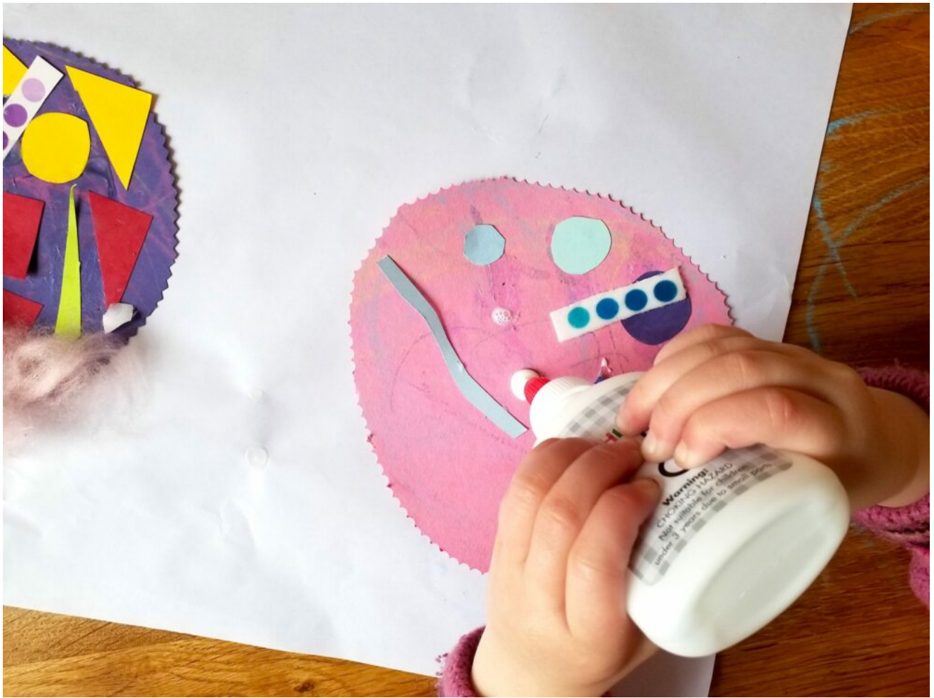
Gluing shapes on 'Calm Cat's' face.