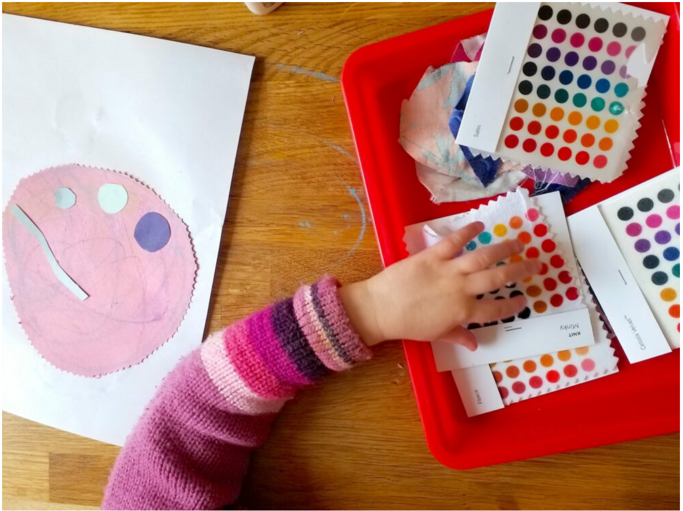
Choosing 'calm' fabrics and textures.