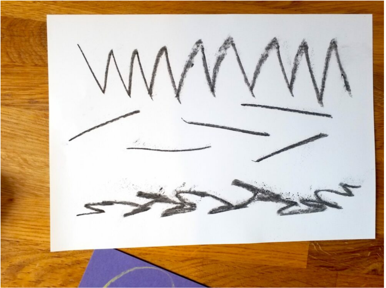
My angry lines.