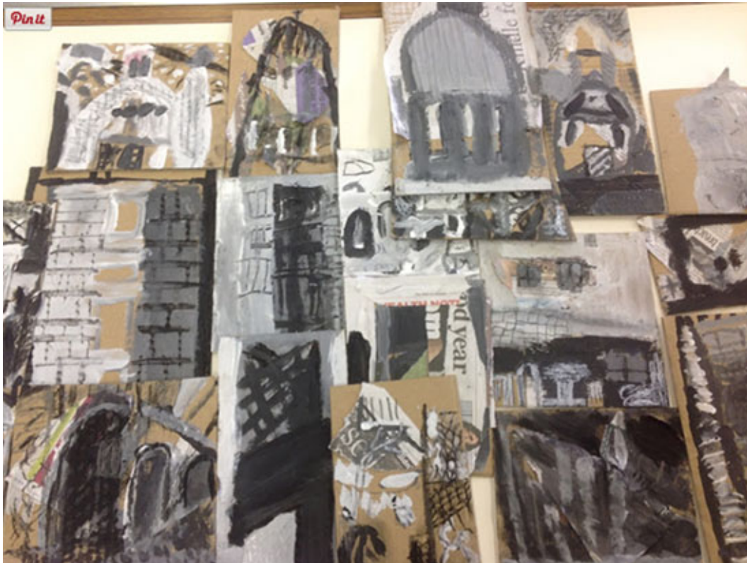
Year 4 Rome Topic