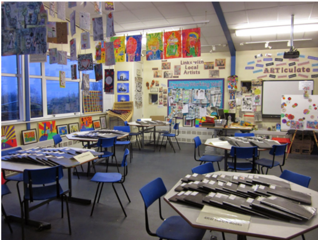
Gomersal Art Room