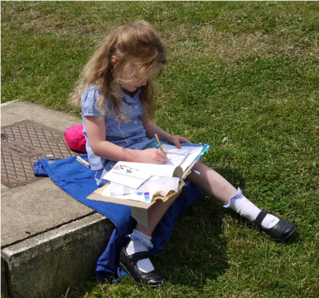
Sketching at lunchtimes