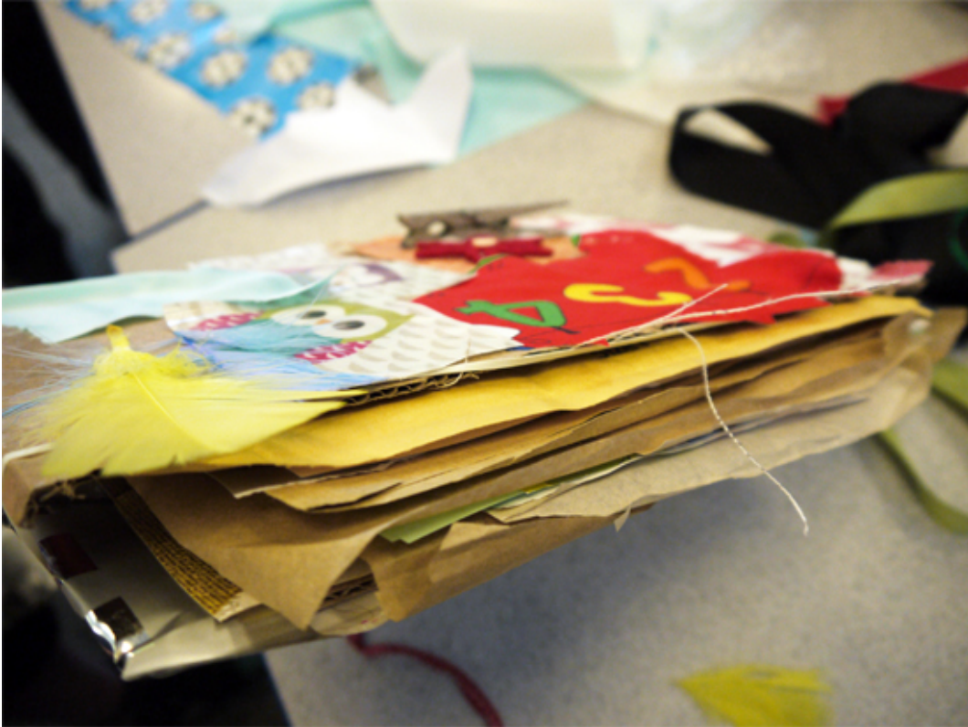
Personalising covers to encourage ownership