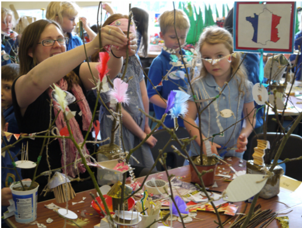
Making treehouse sculptures - a whole school project

The whole school (very bravely) decided to make tree house sculptures. Following a short introductory assembly, and with a number of parent helpers and TAs present, children then went back to their classrooms to make sculptures! The focus was on how to manipulate and construct materials, balance elements, and to "design through making". The children kept up the making for the whole day, and then in the late afternoon we took the tree houses onto the field to enjoy.