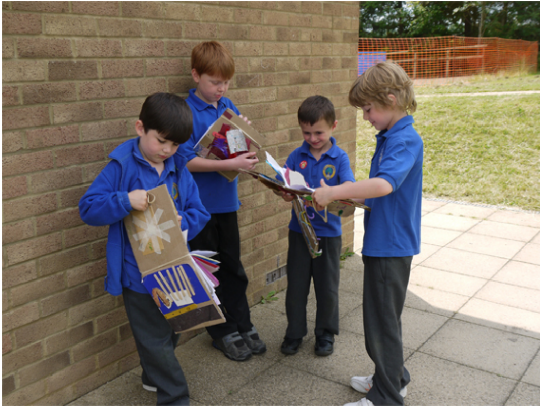
Sketching at lunchtimes