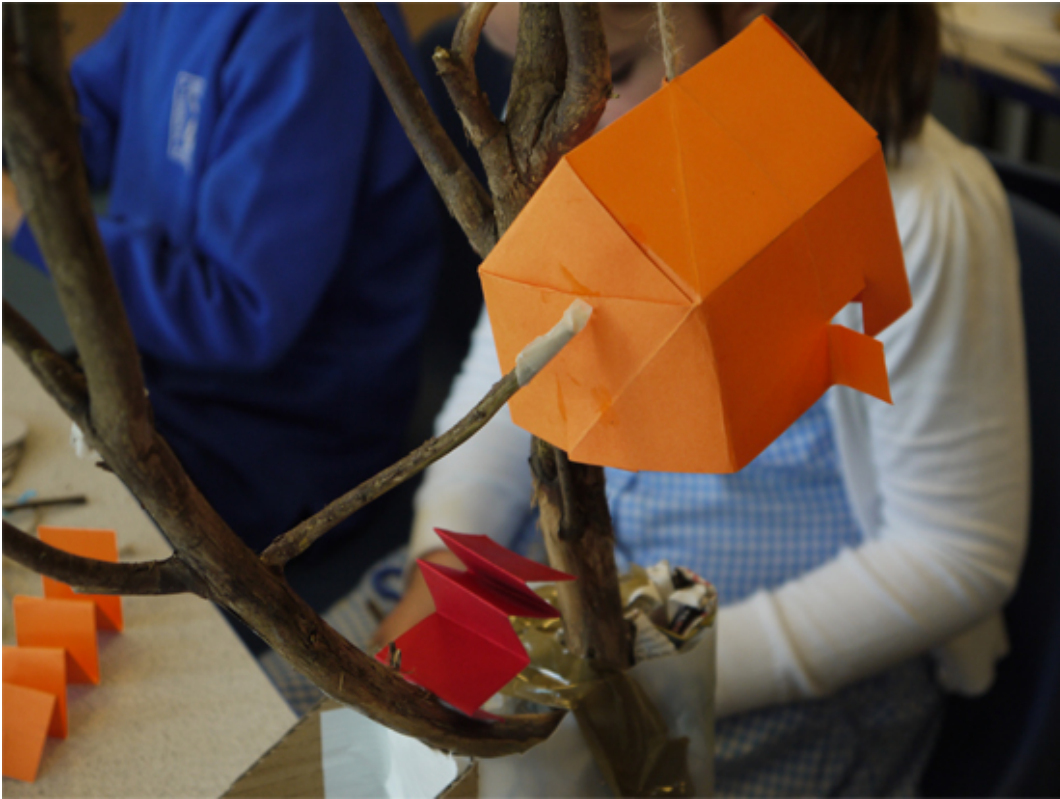
Cardboard house secured with a stick