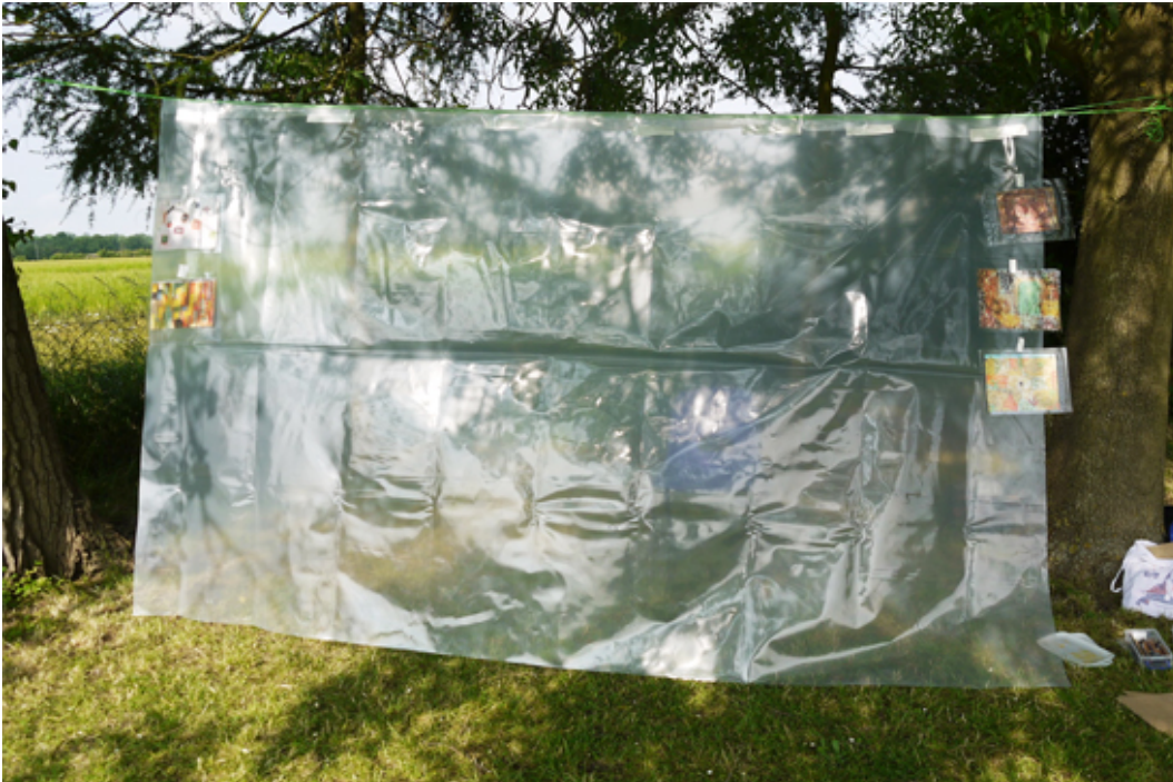
Suspended polythene ready for the collage

scene, such as a leaf, twig, seed head. We added the images to a polythene sheet, and as the collage grew I directed or challenged different groups to produce different types of drawings with varying foci to balance the finished collage.