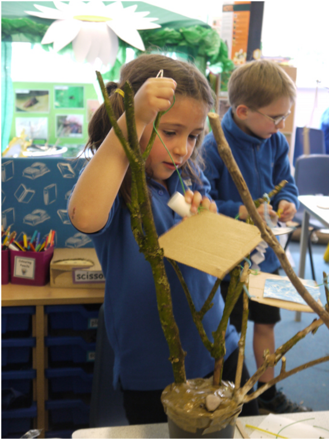
Each child made their own treehouse