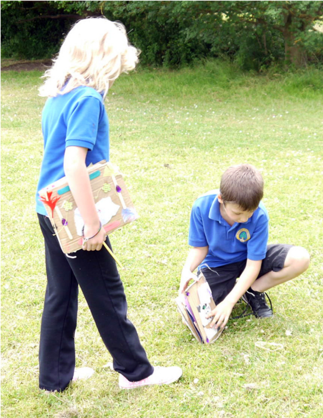
Sketching at lunchtimes