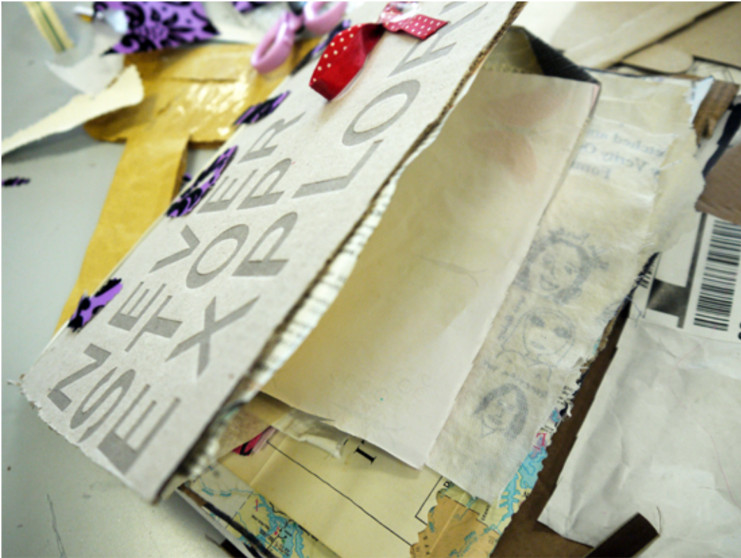
Eclectic materials to inspire making