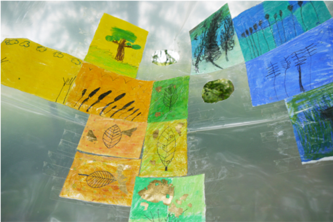
Cutting holes in the collage