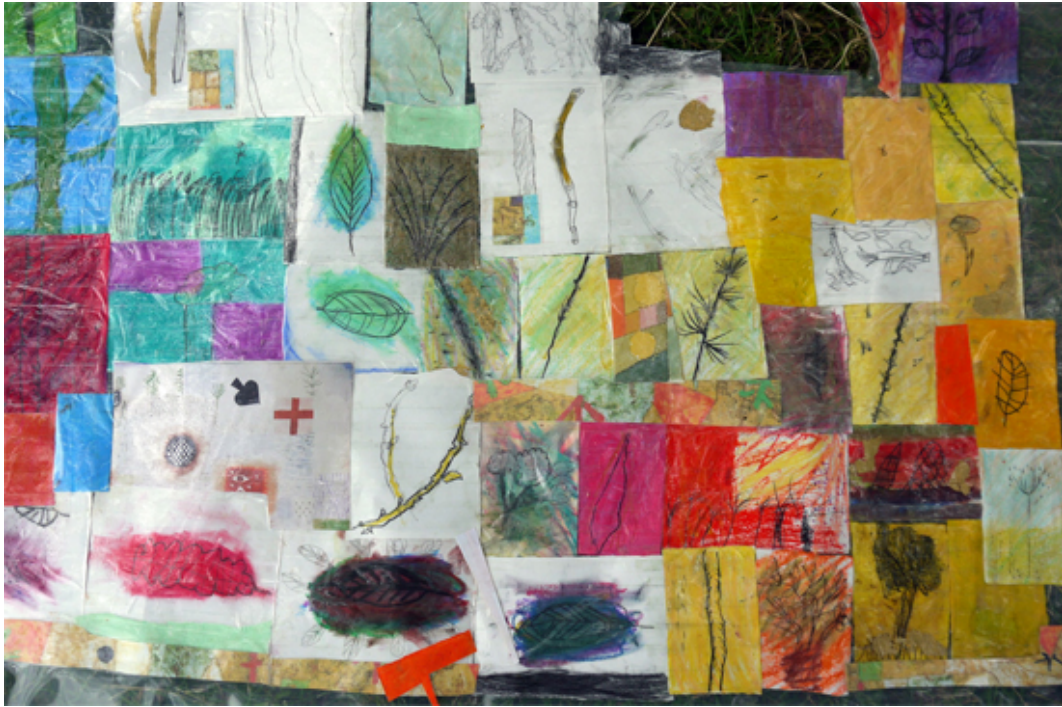
Completed image block