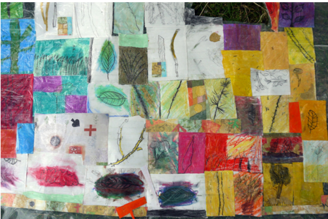
Completed image block