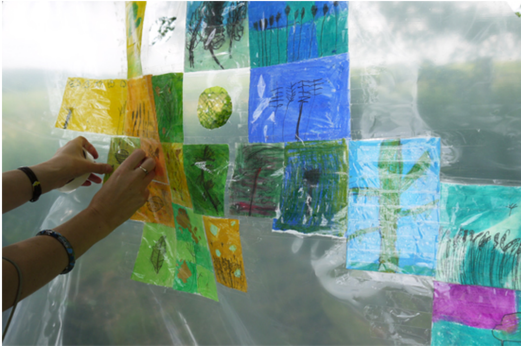
Adding the small image blocks to the sheet