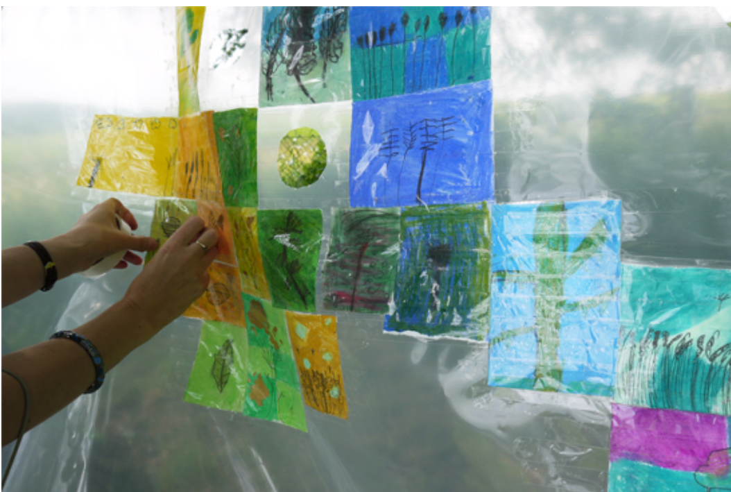
Adding the small image blocks to the sheet