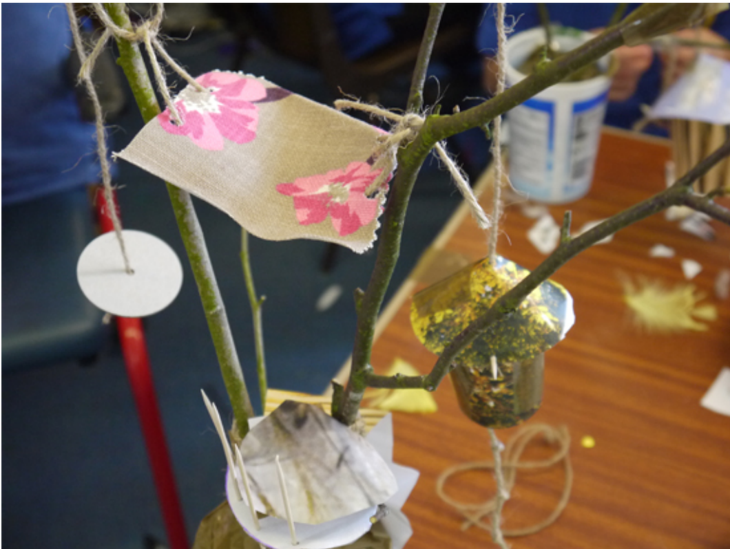
Canopies made from fabric