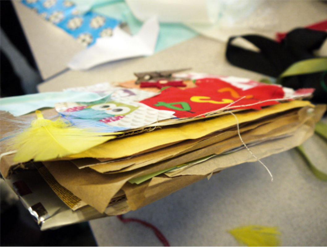
Personalising covers to encourage ownership