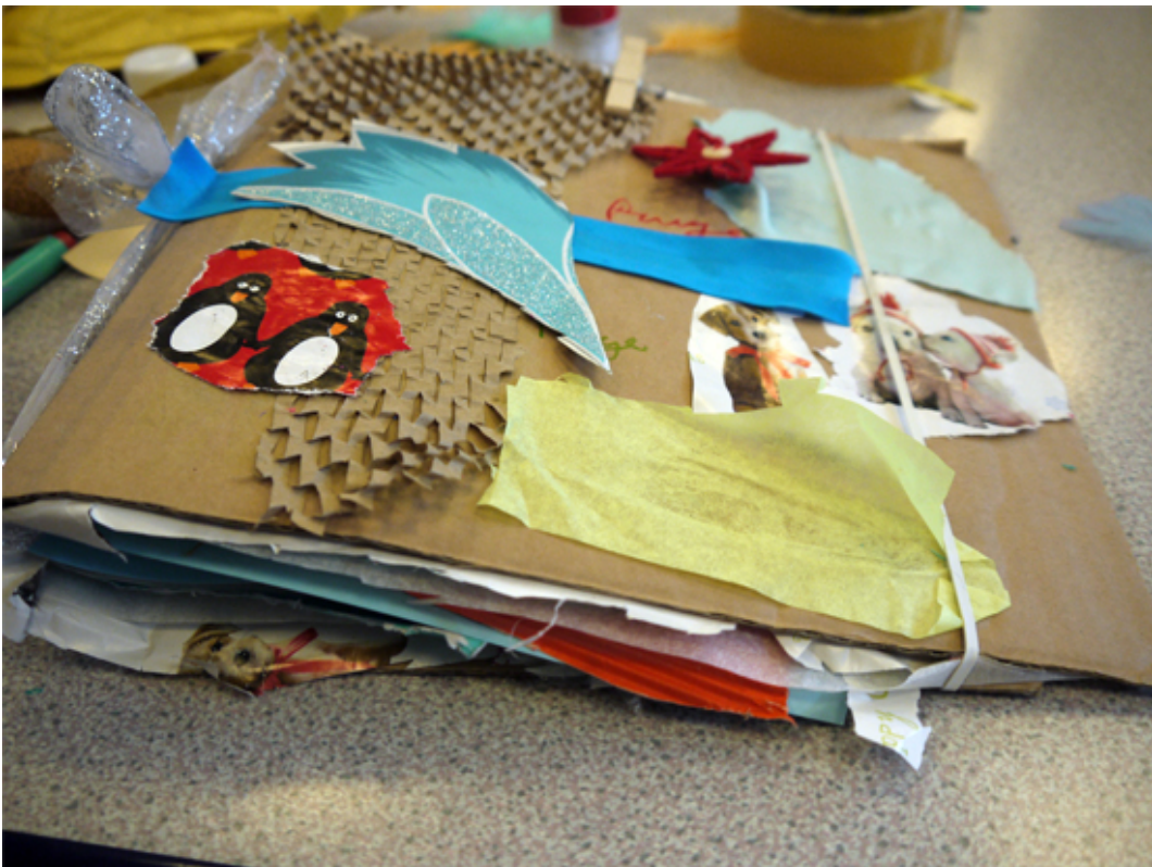
Personalising covers to encourage ownership