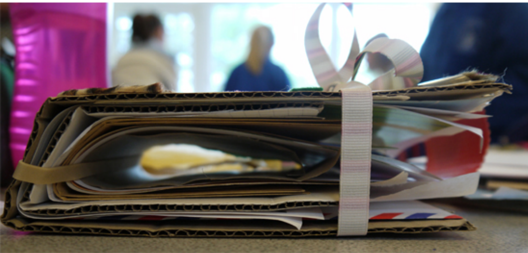
Secured with elastic bands and ties

Teachers used drawing exercises to help develop their sketchbook work. The ownership that the children felt towards their sketchbooks was very apparent!