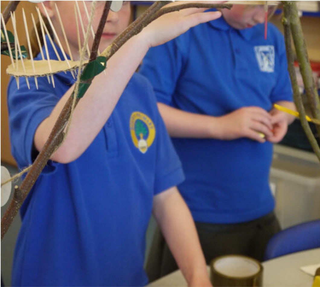
Children were encouraged to think about how to balance their tree houses