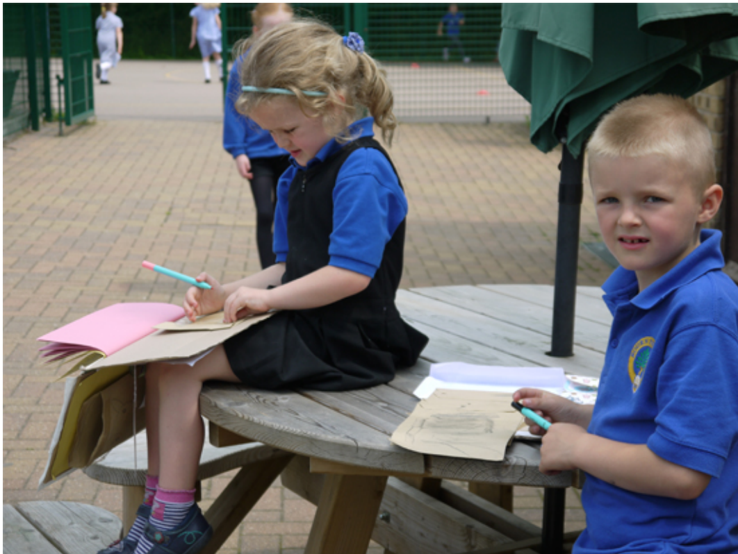
Sketching at lunchtimes