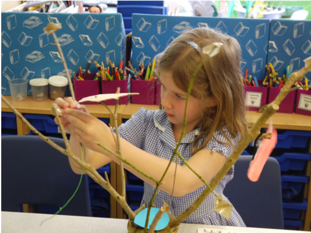
Sticks secured in pots and then "dressed" with inventive treehouse elements