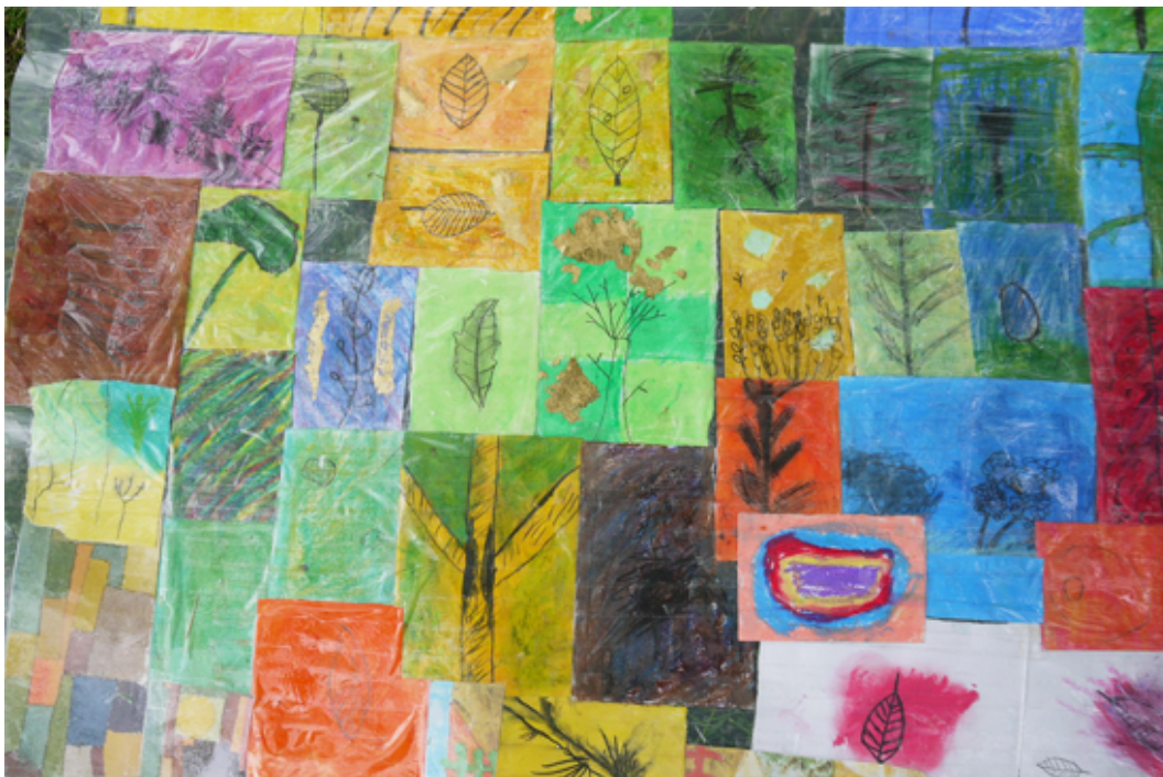
Communal collage: completed image block