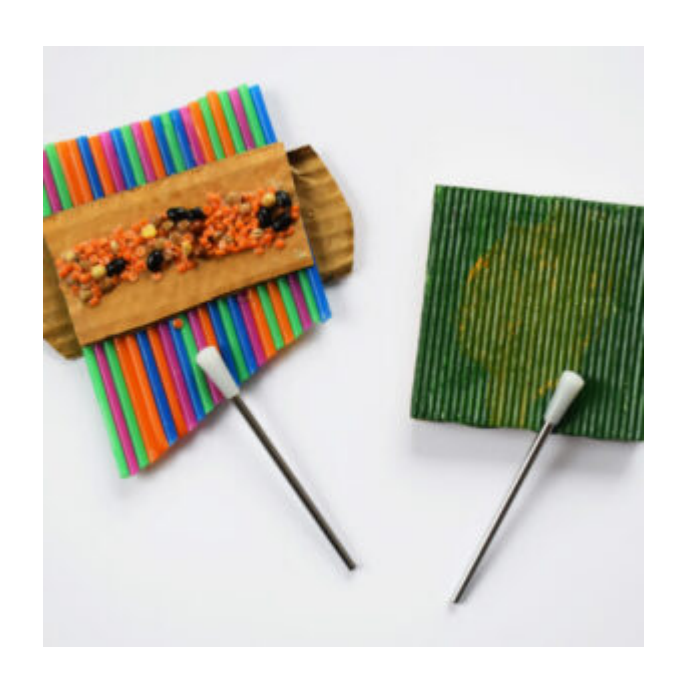
This is featured in the 'Music and Art' pathway