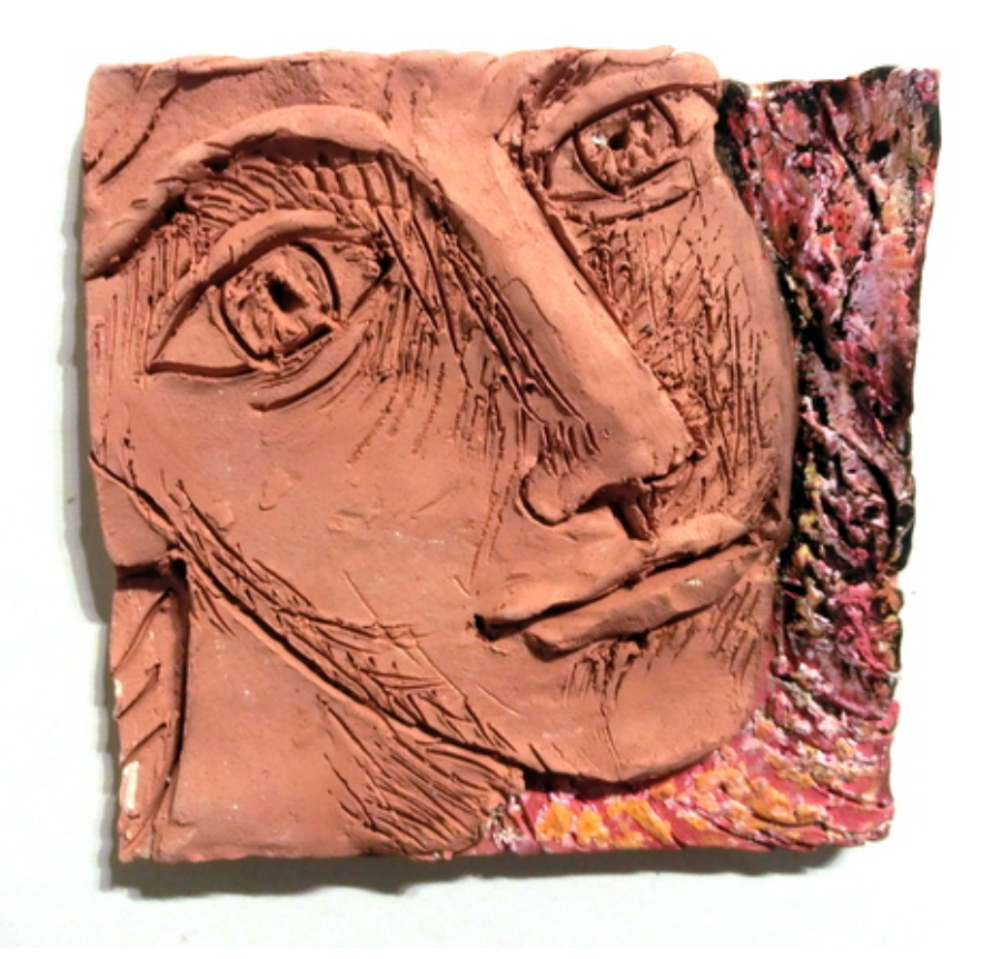
Exploring Portraiture with Eleanor Somerset

In this resource artist Eleanor Somerset shows how she led students in <u>The Little Art Studio</u>, Sheffield, to explore and discover portraiture through various media.