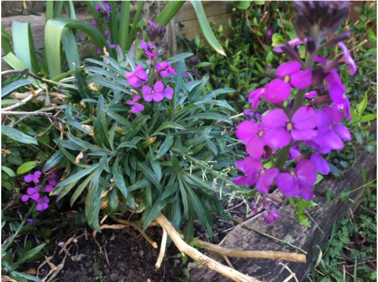
A purple wall flower provided some small delicate flowers