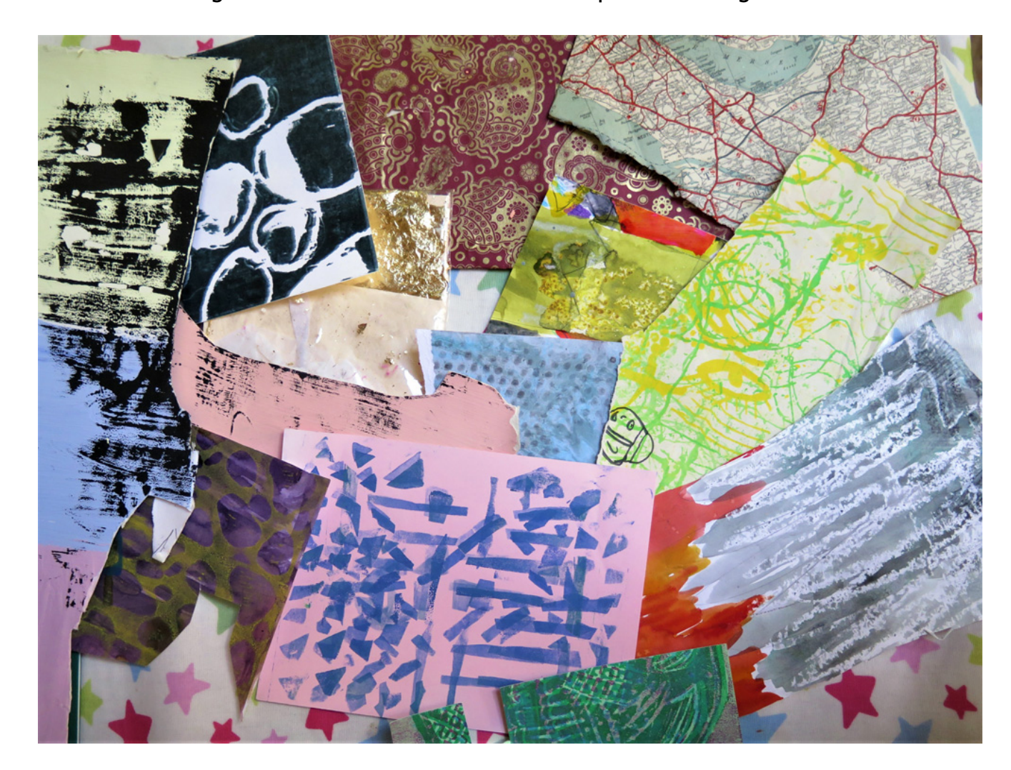
Printing- Collograph & Monoprint

• Black glitter sand is much cheaper than glitter.