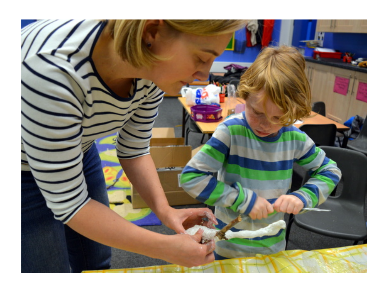
See AccessArt's policy as an exemplar

Document your Teaching & add it to the AccessArt Resource Pot!