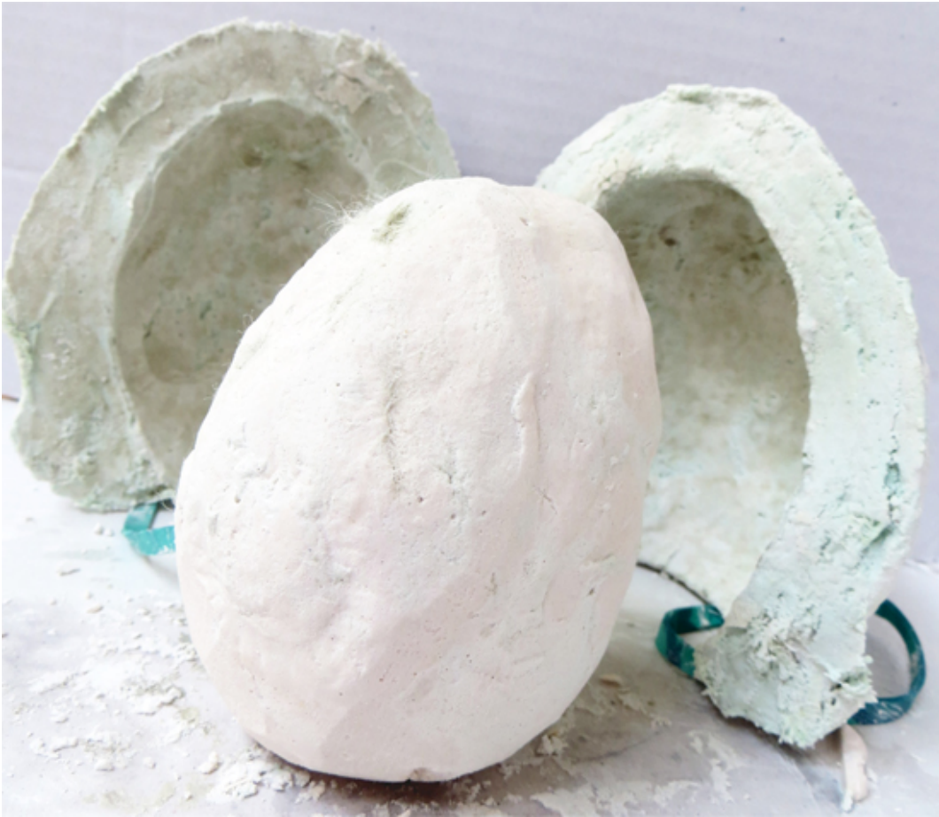
The final plaster egg and its mould