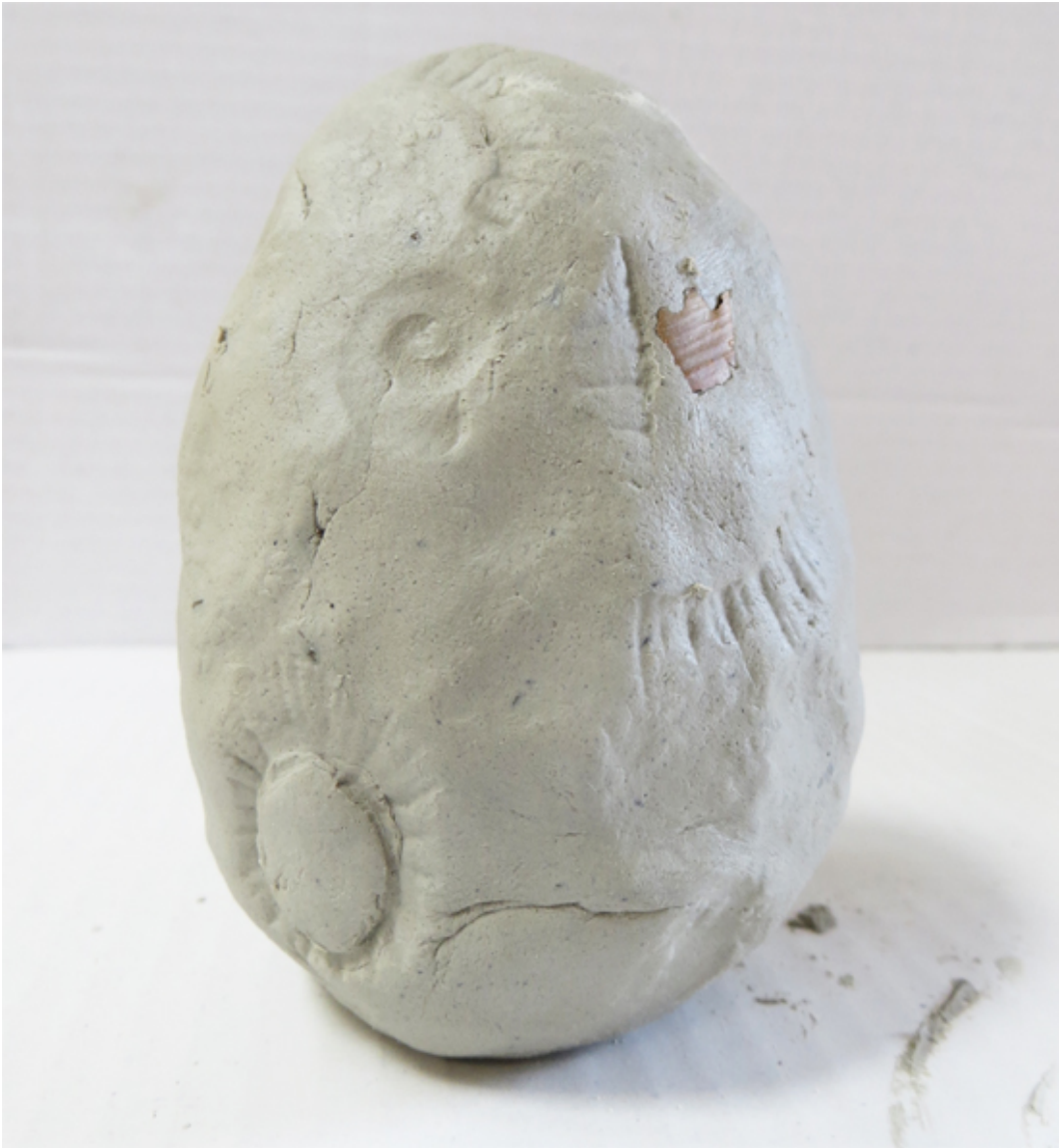
The clay egg