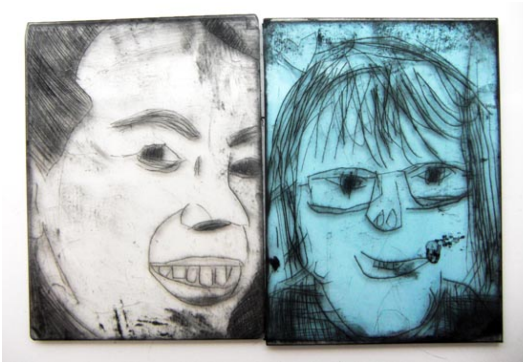
Inked-up perspex etchings

"I had been looking for a way to make simple but authentic etchings with my classes when a friend offered me the use of a table press. Other friends offered me exhibition space, and two of my schools dipped into a rainy day fund to buy beautiful paper, good water based printing ink and sheets of acrylic. It felt like the start of something great!