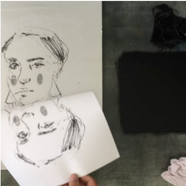
video enabled printmaking resources