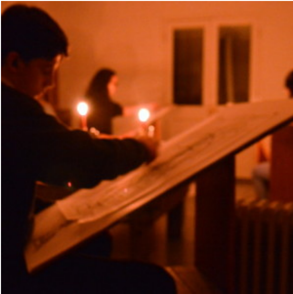
Candlelit Still Life