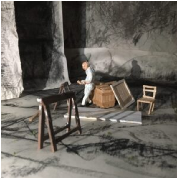
Expressive Charcoal Collage: Coal Mines