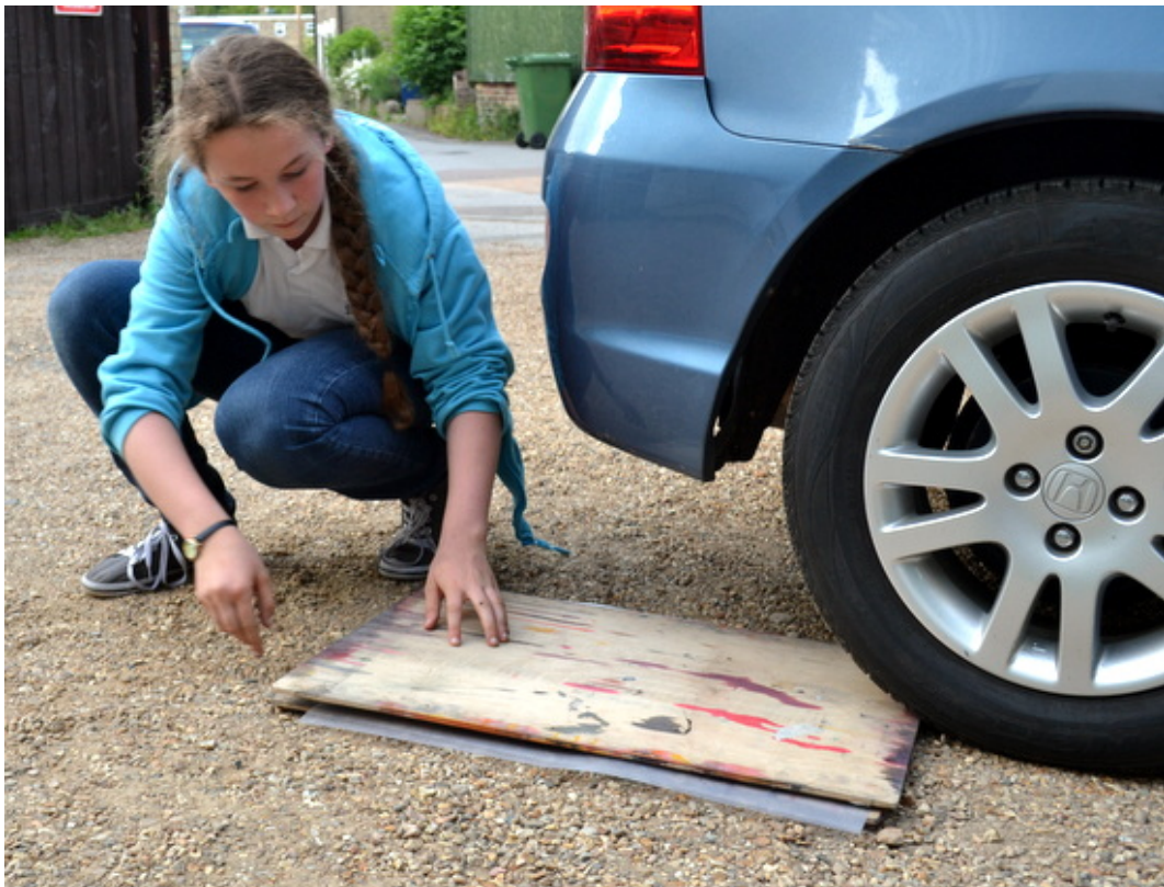
Board over the lot...