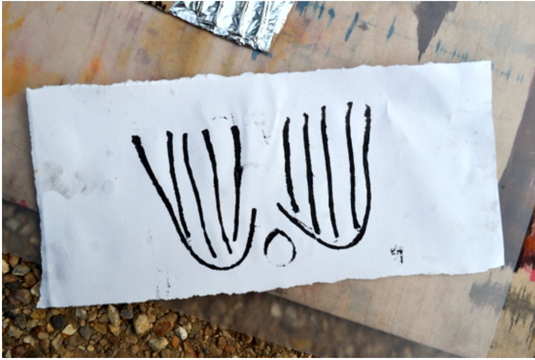
A 'cardboard-sticky back foil-car print' revealed!