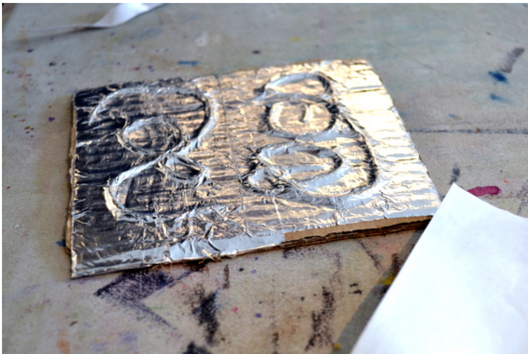
Cardboard and aluminium foil 'plate' ready for print