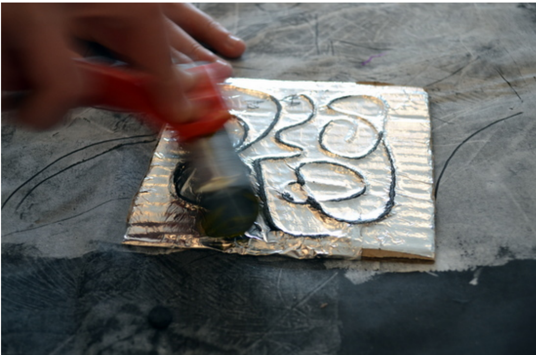
Rolling ink onto the plate