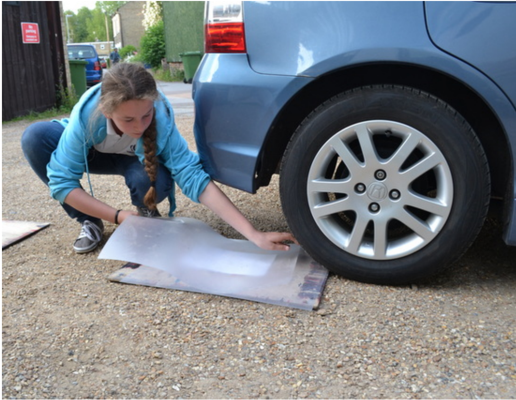
Plastic sheeting on the paper