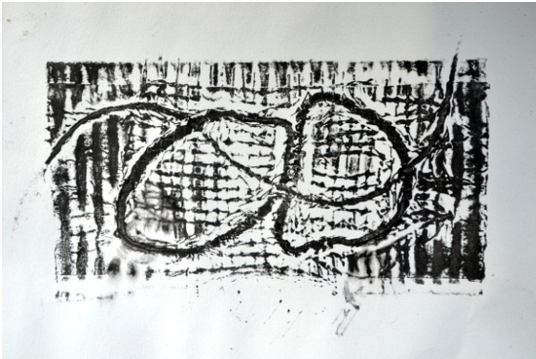
Finished print by Ben