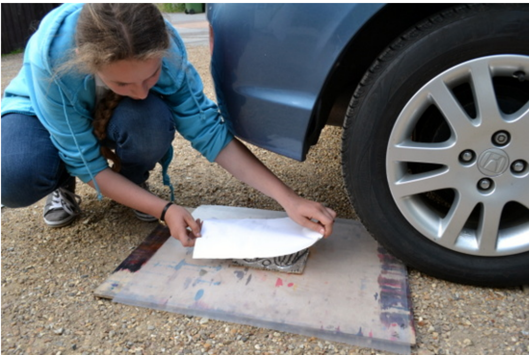
Damp paper carefully laid over the plate