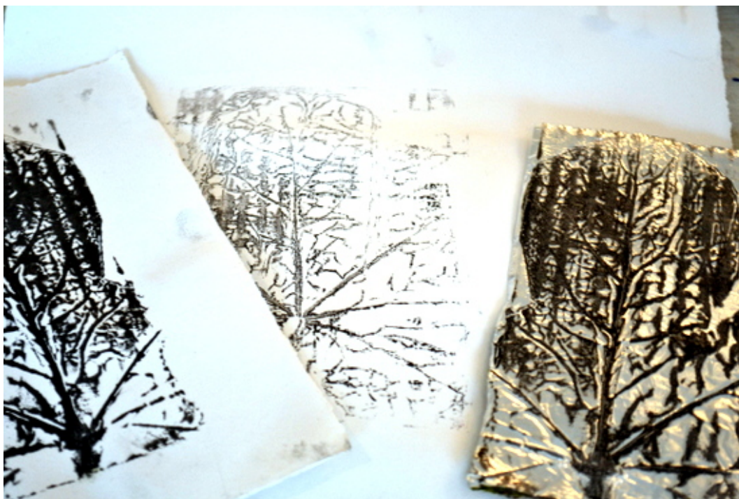
Prints and a plate