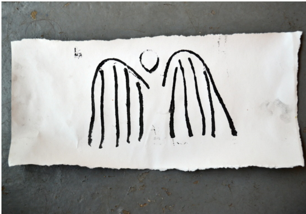
Finished print by Cass