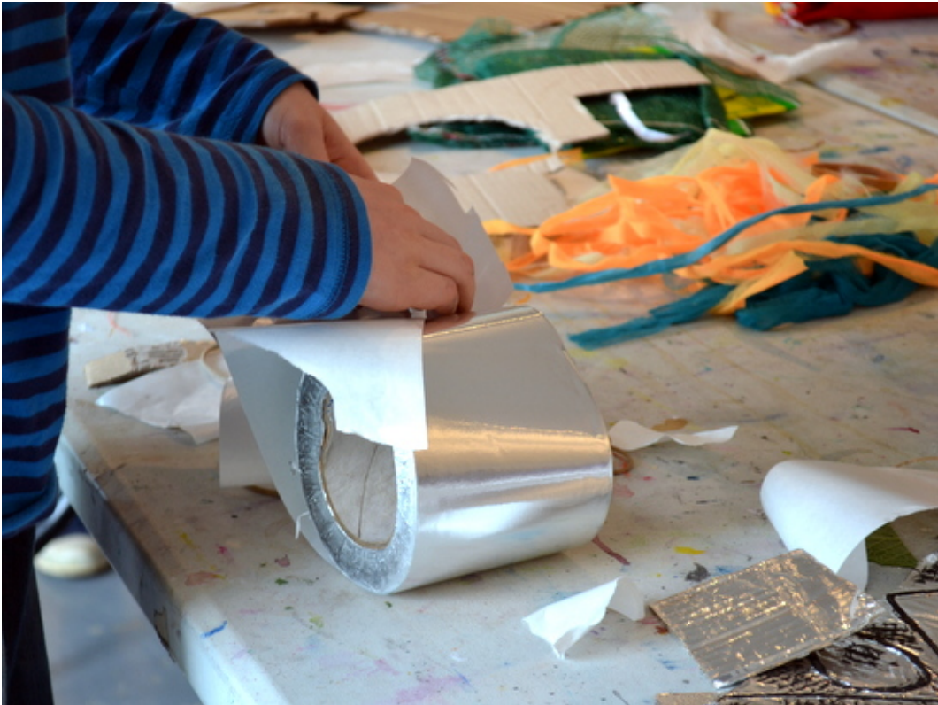
A roll of sticky back aluminium foil from the Community Scrap Shack in Stoke-on-Trent