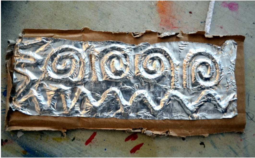
Colograph plate made with string, cardboard and sticky back aluminium foil