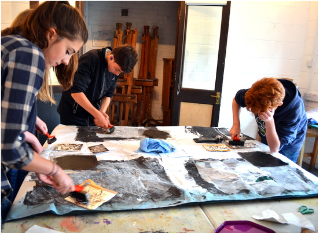
Students 'ink up' their plates