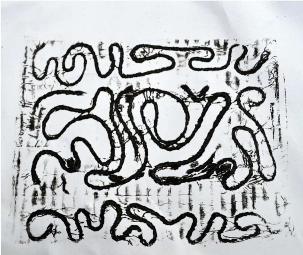
Finished print by Ingo