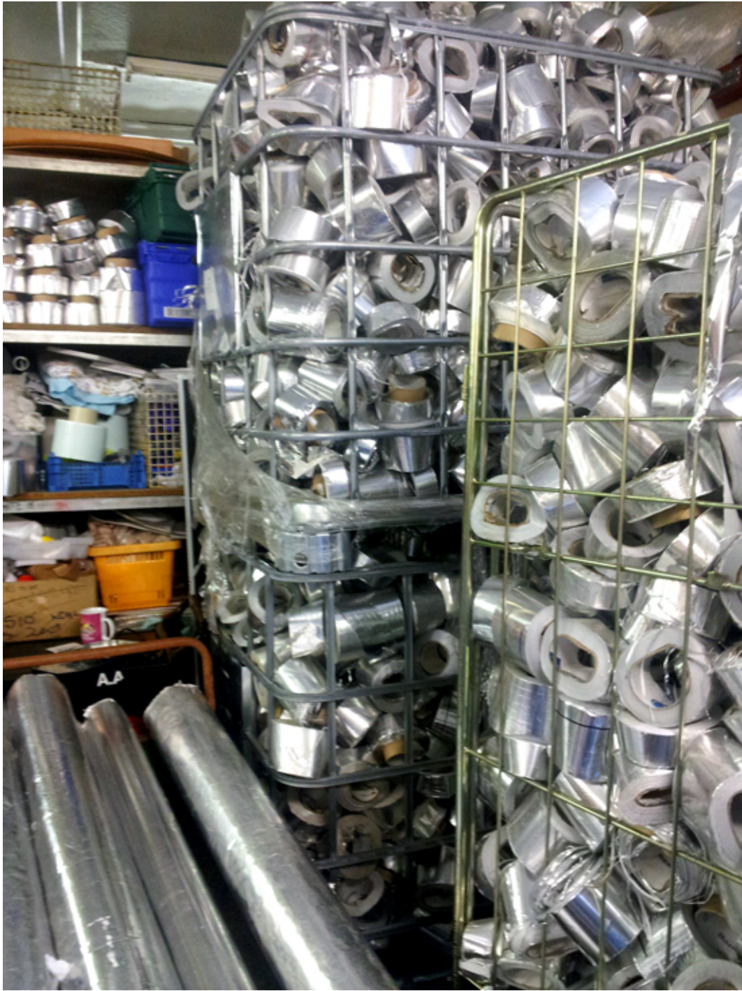
Aluminium sticky back foil saved from landfill by Michelle and team at the Community Scrap Shack

Michelle and Sue at the Community Scrap Shack shared their story of how they received and manged an overwhelming shipment of foil and all the creative applications for it that they have since come up with. Do have a look at the Community Scarp Shack's Facebook Page to see their sticky back foil saga.