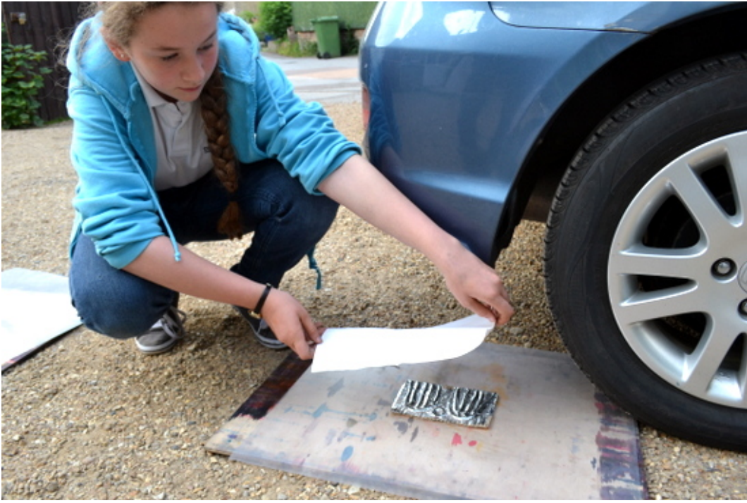
Student lays a piece of damp paper over her inked up plate on a drawing board lined with a plastic sheet