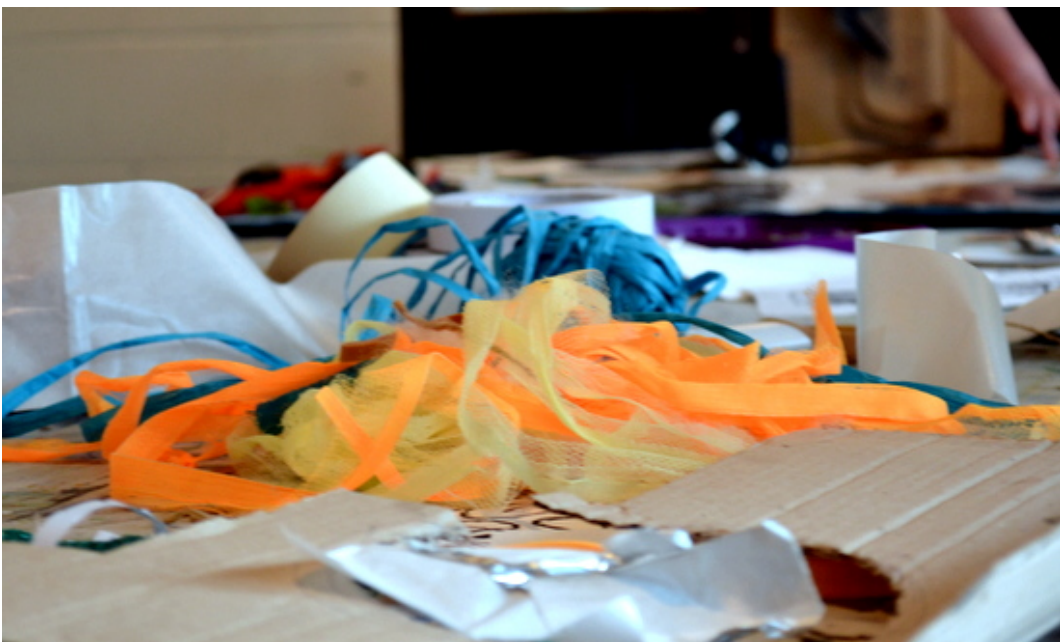
More materials from various scrap stores

This was a rough and ready session - just the absolute print-making basics, and I hope that colleague print-makers, who are