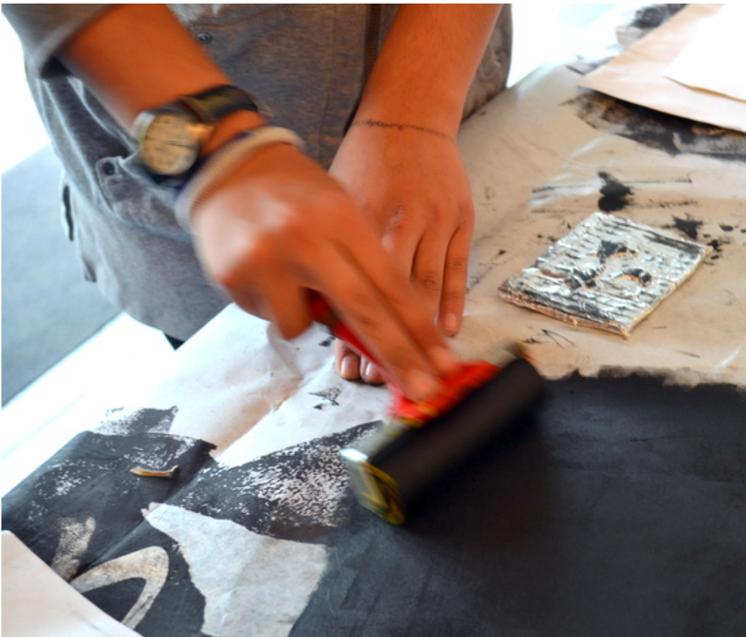
Preparing the roller by rolling and working a thin layer of ink onto acetate