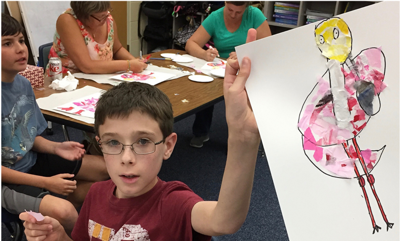
Finished Roseate Spoonbill