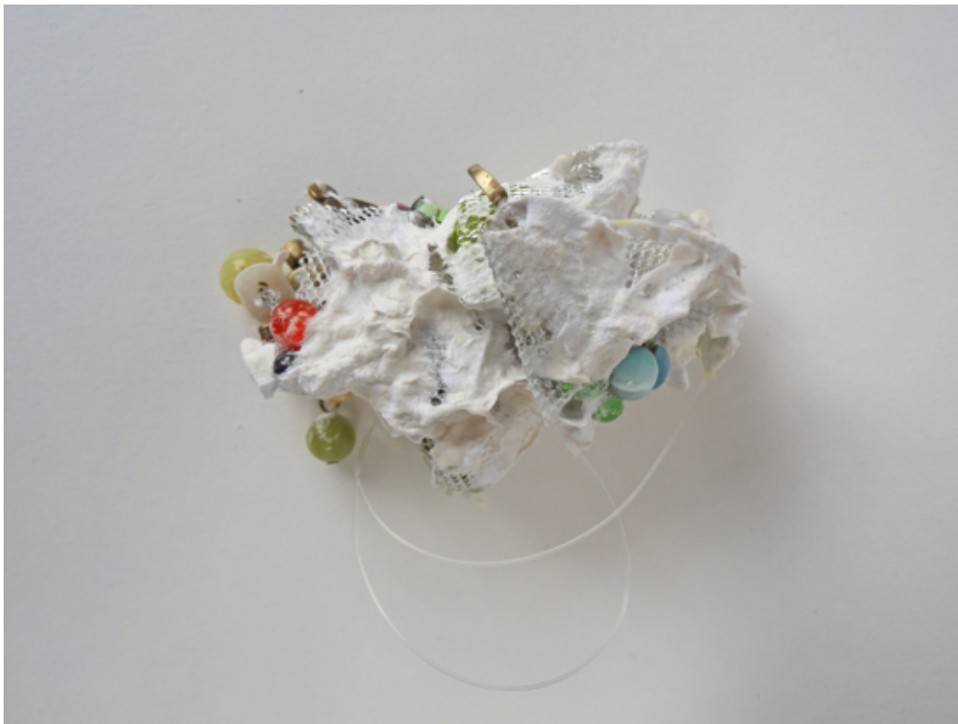
Mesh wrapped stones dipped in paper pulp

Use paper pulp to explore the transformation of objects into fragile sculptures in this simple and easy making process. Bind forms with threads, fabric and mesh to catch the layers of paper pulp, creating a variety of textured detail and a contrast of sculptural mass with line .