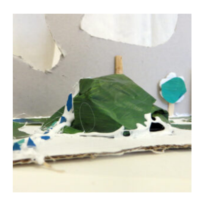
set design resources