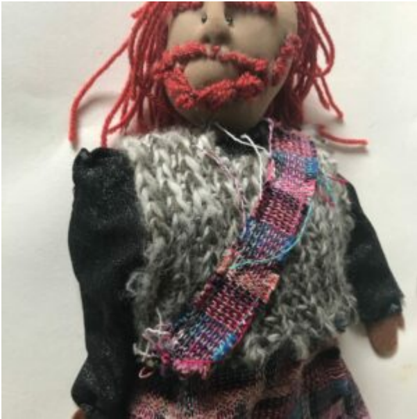
Pop up puppets