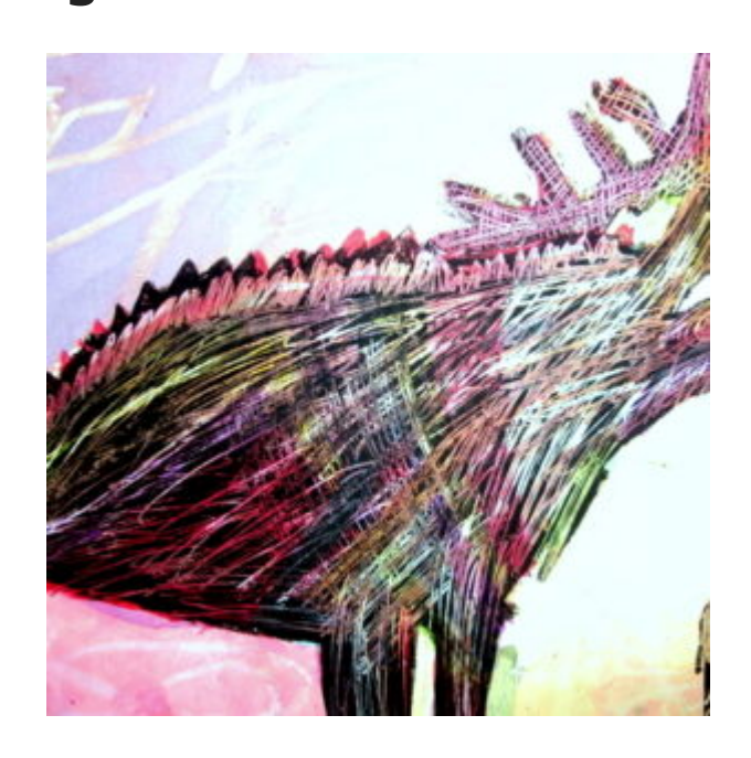
Chimera Drawings into Beautiful Terracotta Tiles