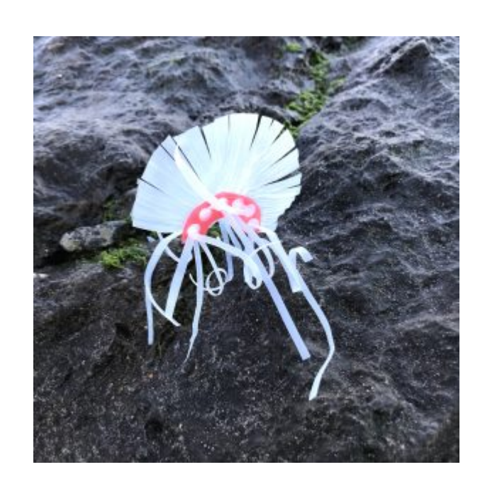
Sea Sculptures from Plastic Bottles