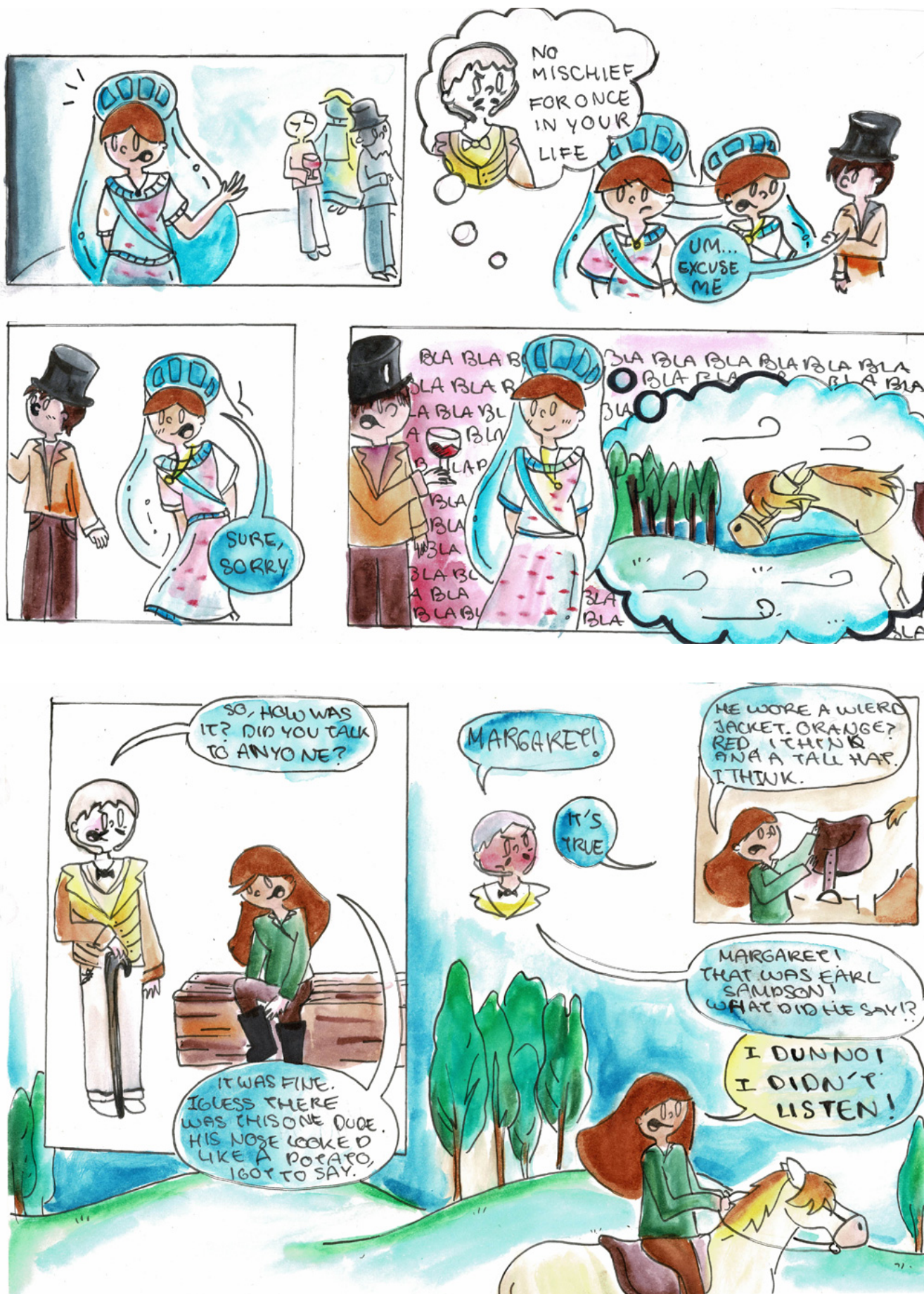
A participant's comic, inspired by a Victorian figurine from The Fitzwilliam Museum's collections.