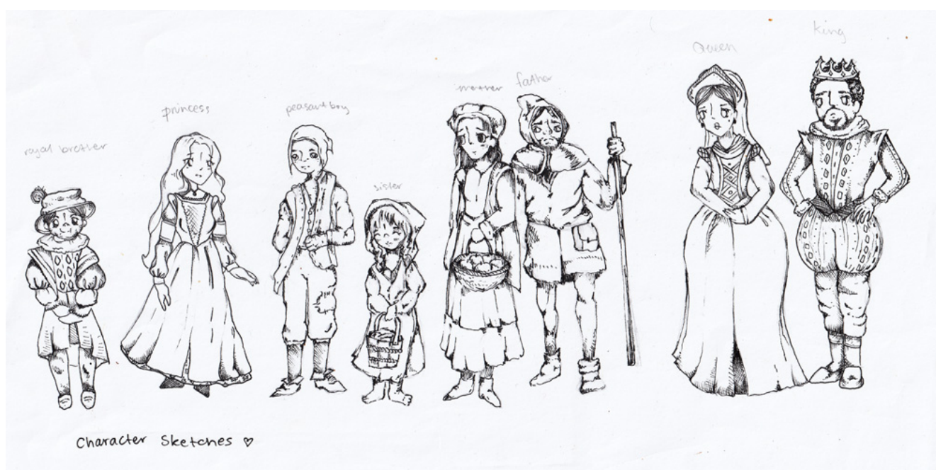
Character designs created by a participant, for a comic

I am currently in my final year of MA Education (Artist Teacher Practice) at Oxford Brookes University. For my Major Project, I chose to investigate how young people make meanings from objects in museum collections. I was very lucky to recruit a small but very enthusiastic group of young people, including AccessArt Young Artists , to help me with my investigation.