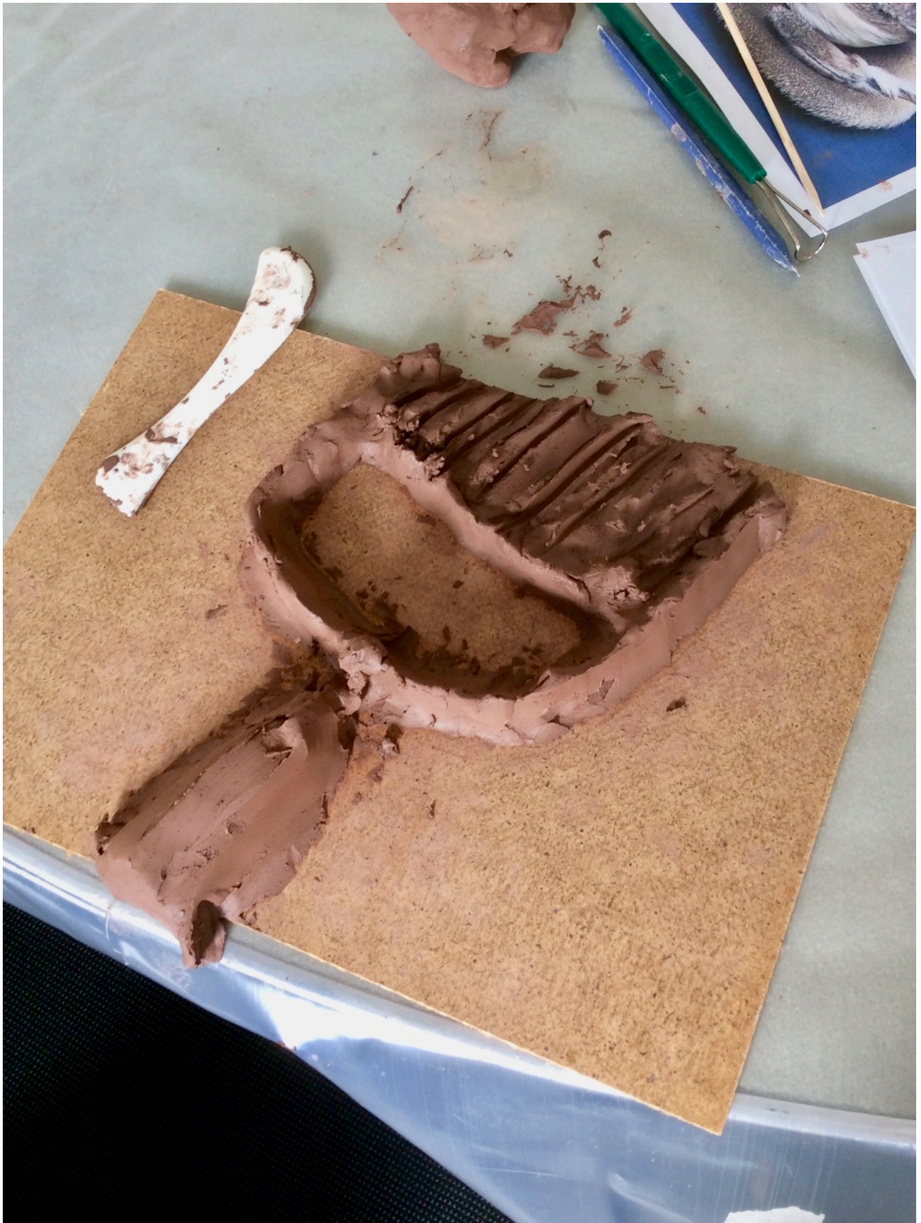
Revealed! A 1940's potato slicer - An interesting and unusual shape, unfamiliar and with a specific function and purpose.