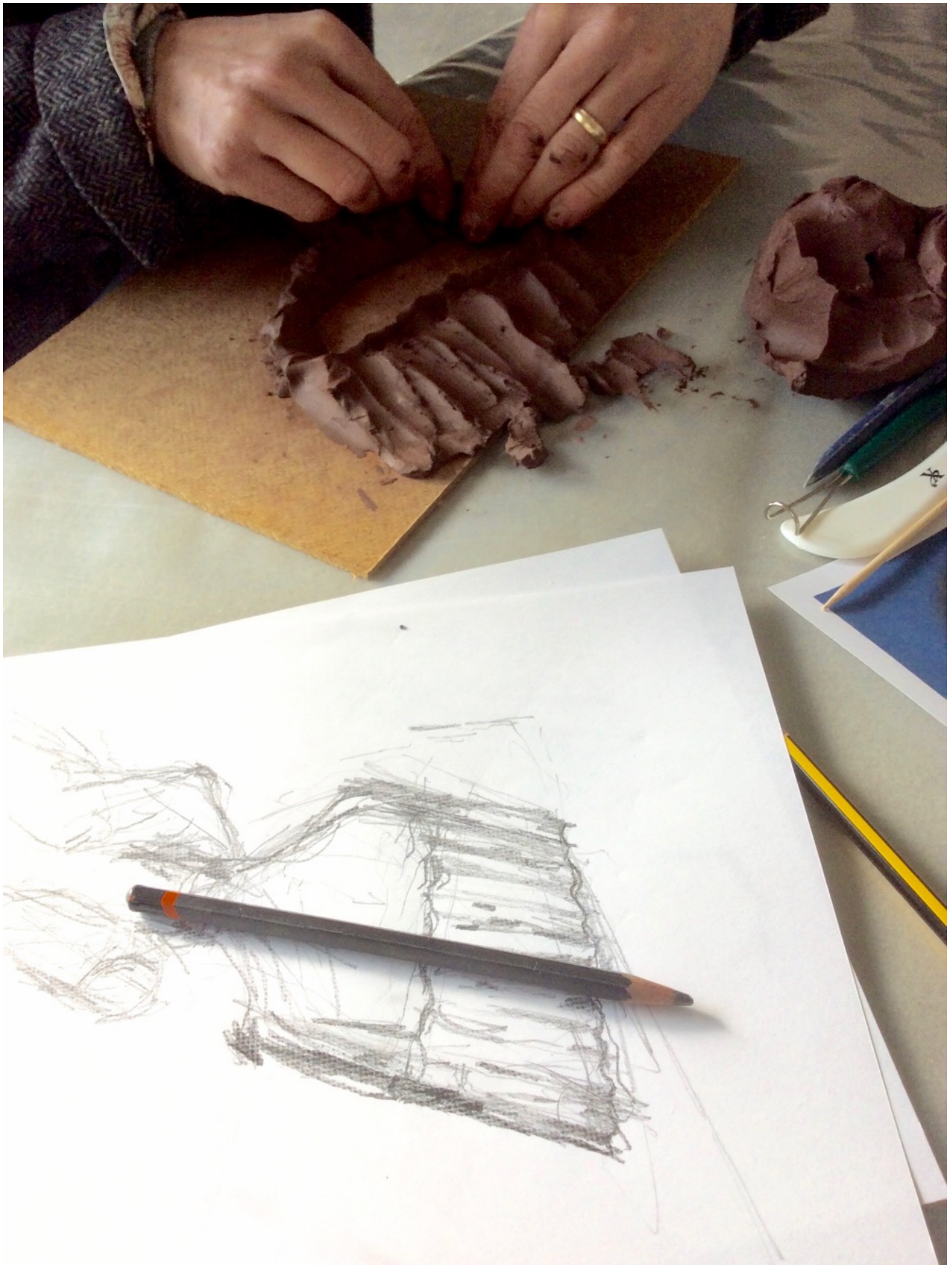
From blind drawing to making in the blind - A 1940's potato slicer triggered a discussion about homes and living in that decade