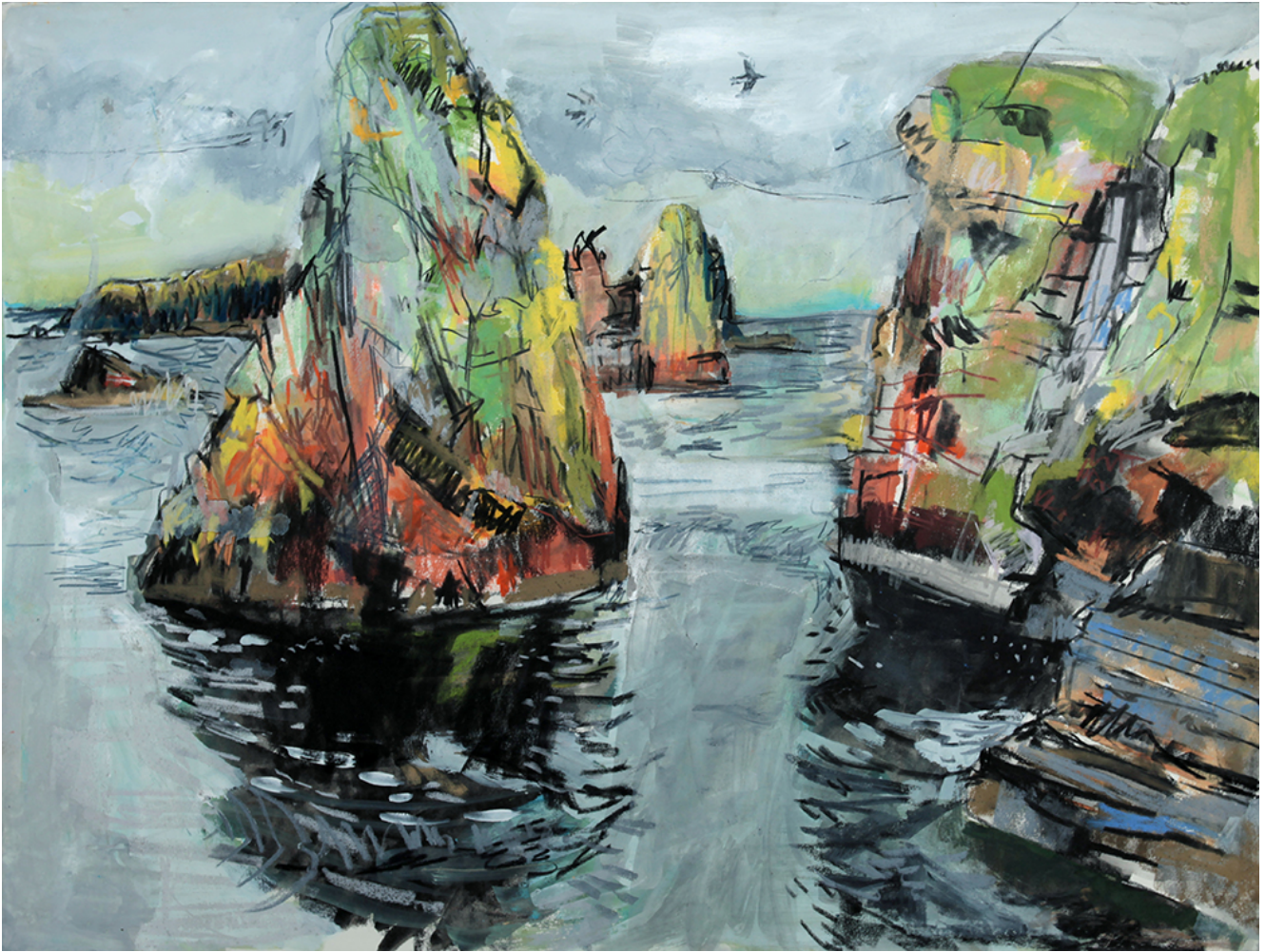
The final piece - Maiden Stack, Papa Stour, Mixed media on paper

My main area of interest are the creatures that inhabit the natural world around us – I am as interested in the blue tits foraging for nesting materials in the discarded mattress outside my city centre flat as I am in the huge, all-encompassing sea bird colonies which are found around our coasts in summer. However, it is often easier to watch animals where there are less humans to disturb me so my work tends to be made in remote locations.