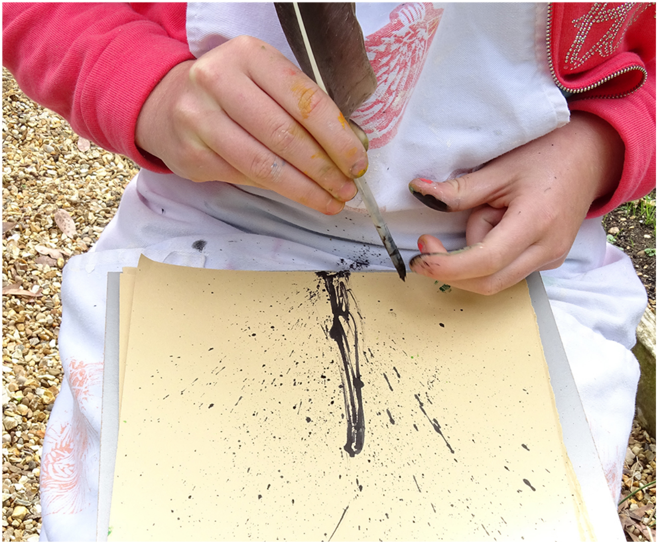
Ink and nib