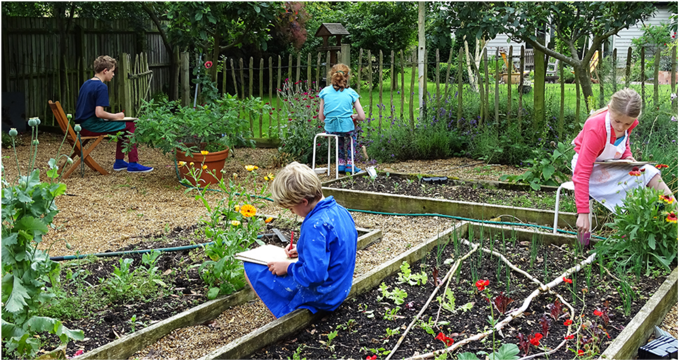
Drawing in the garden

A beautiful morning spent drawing in the garden was inspired by the notion of Myriorama . I remember being fascinated by myriorama cards (or as I knew them "never-ending landscapes") as a child. Each card has a slightly different landscape image, but with the starting and end points of each image to the left and the right of each card drawn in such a way that the cards can be arranged in any order to create varied and never-ending landscapes. The word myriorama was invented to mean myriad pictures , following the model of panorama, diorama, cosmorama and other novelties ( https://en.wikipedia.org/wiki/Myriorama_(cards) ).