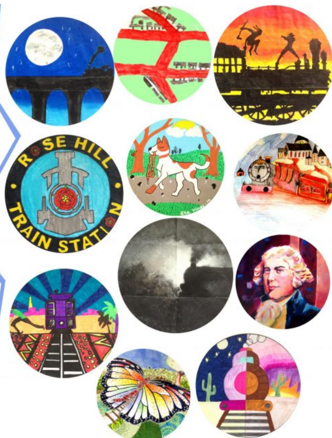
Such an impressive effort was also made by the high school students.

Once the sketches were chosen the children were notified and the feedback we received was that they felt like they had won the lottery! We then set out a plan to run workshops in the schools throughout June and July. For the primary schools, I worked with small groups of children up to around 6 with the help of a Teaching Assistant. I went in with the prepared circles with lots of pre-mixed acrylic paints in little pots with lids. We were kindly donated a huge set of new Posca paint pens and high-quality poly colour pencil crayons and these were a real favourite with the children.