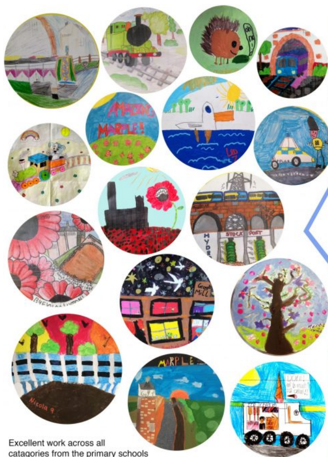
Excellent work across all categories from the primary schools