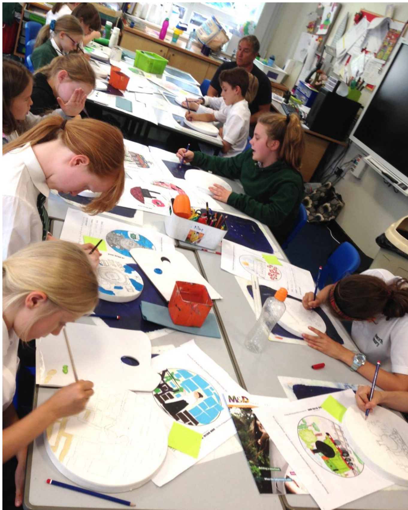
The high school pupils worked in the school art department, making a start on their pieces before being left to complete