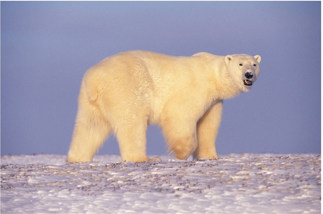
public domain animal CC0 photo.