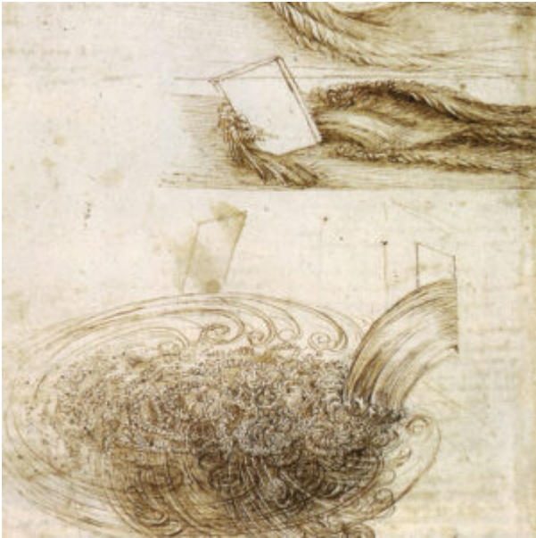
Our River – a Communal Drawing