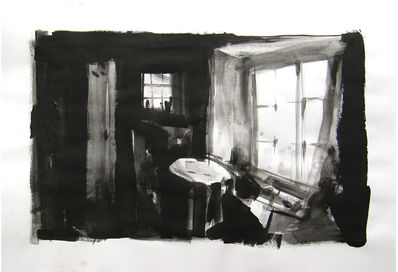
'Inside the Cabin at Bucks Mills', acrylics by Hester Berry

"Tone" is the word we use to describe light and dark, or light and shadows.