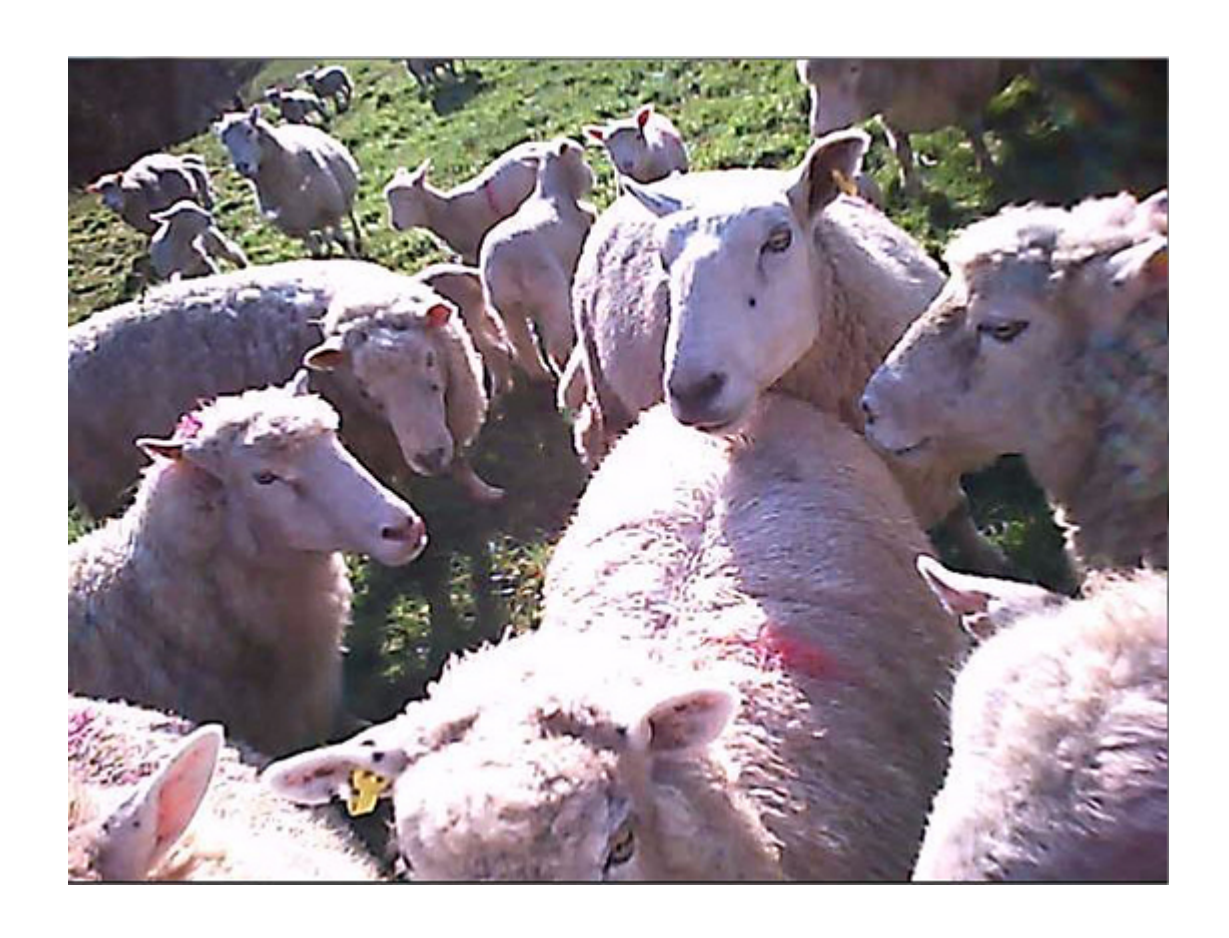
Key Stage 4