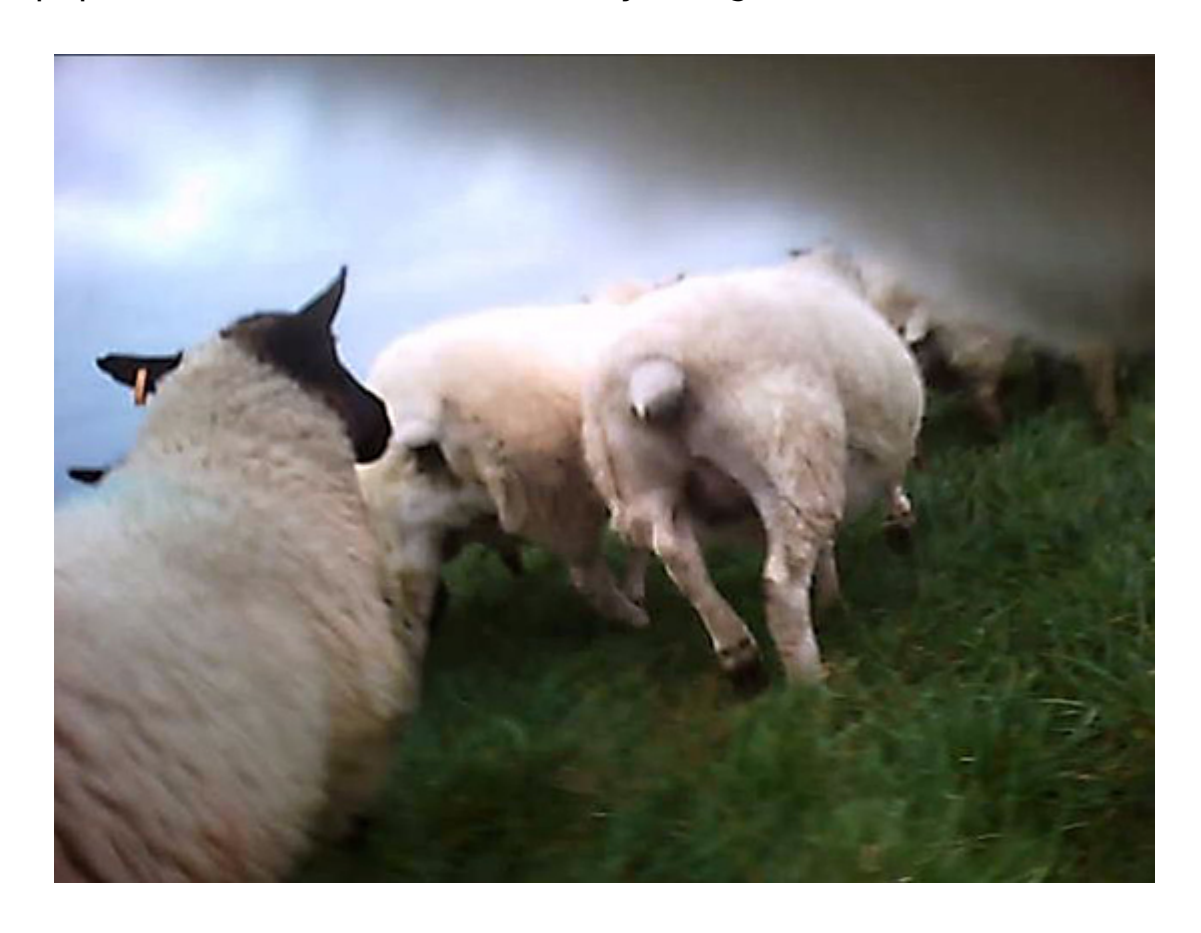
Key Stages 1 - 3

Use the buttons below to explore how you might work with pupils in each different Key Stage.