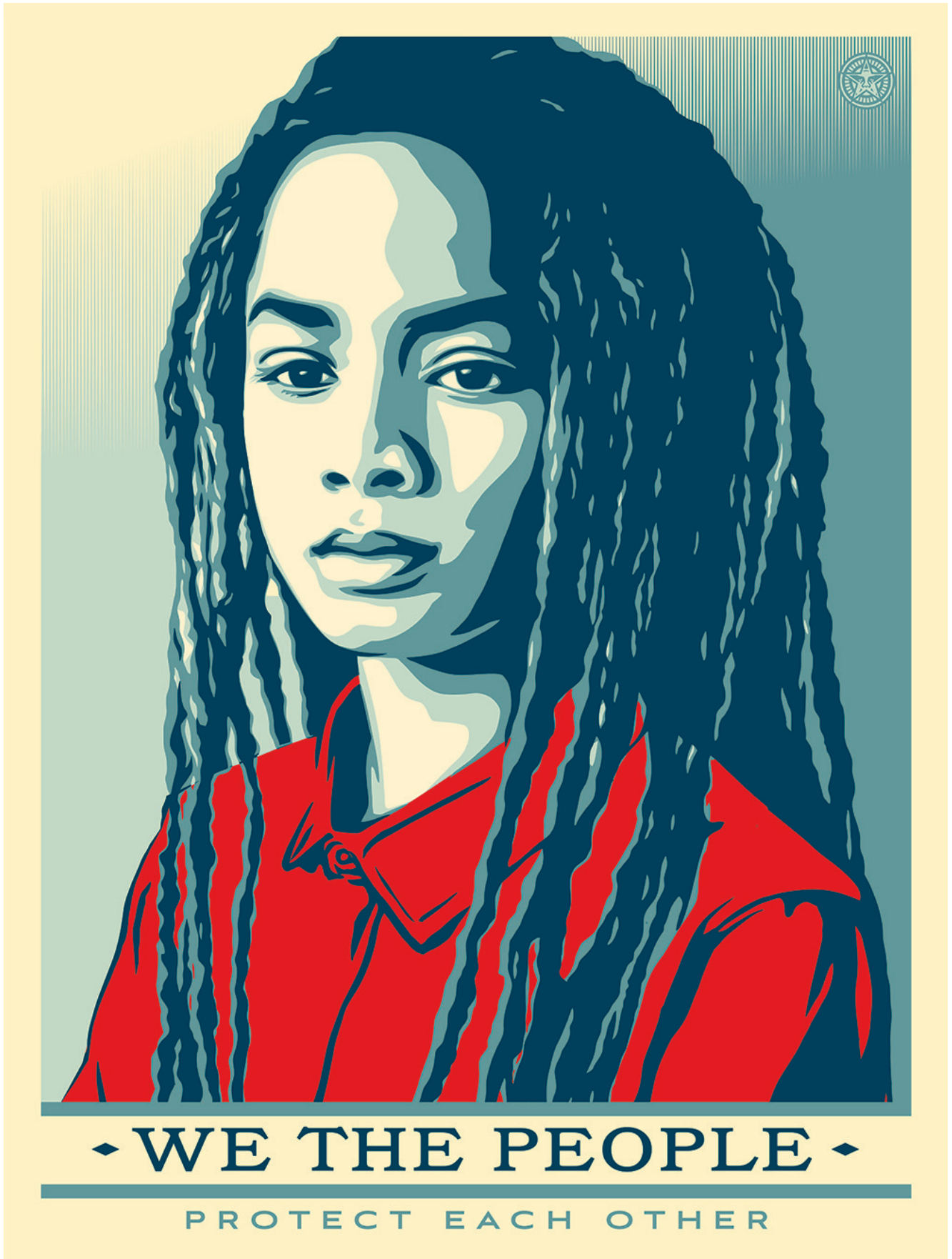
We The People by Shepard Fairey