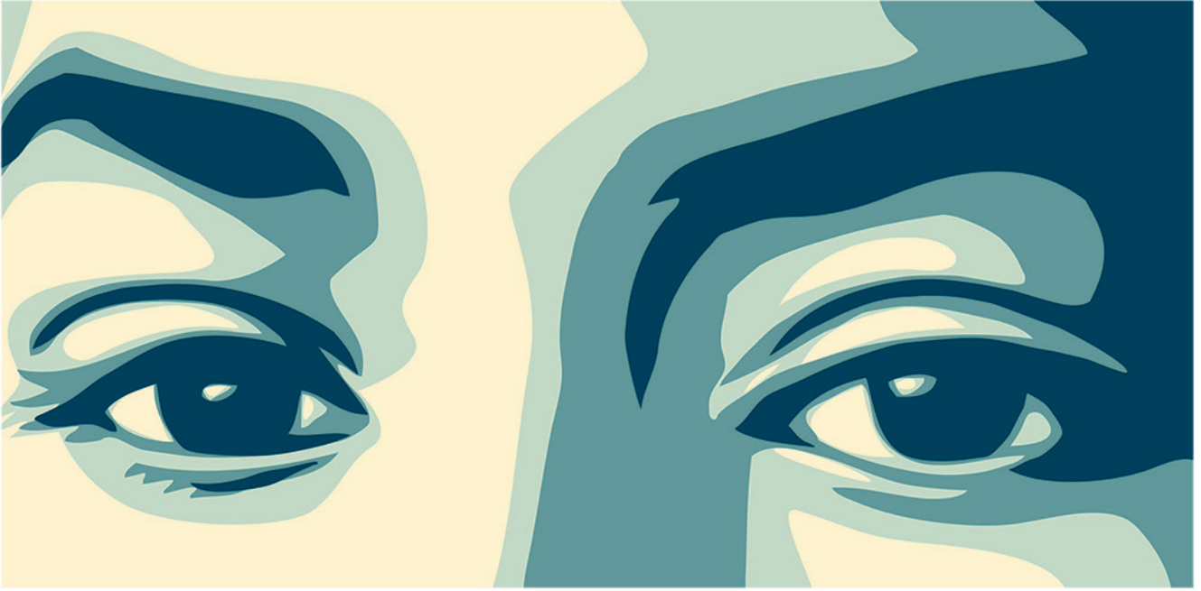
We The People (detail) by Shepard Fairey