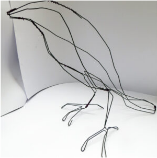
drawing with wire