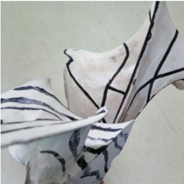
Wet Strength Tissue Paper Cups