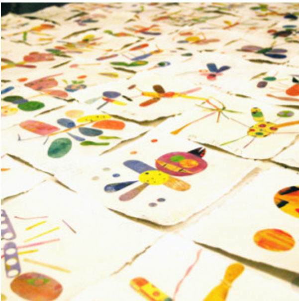
Flora and Fauna Pathway