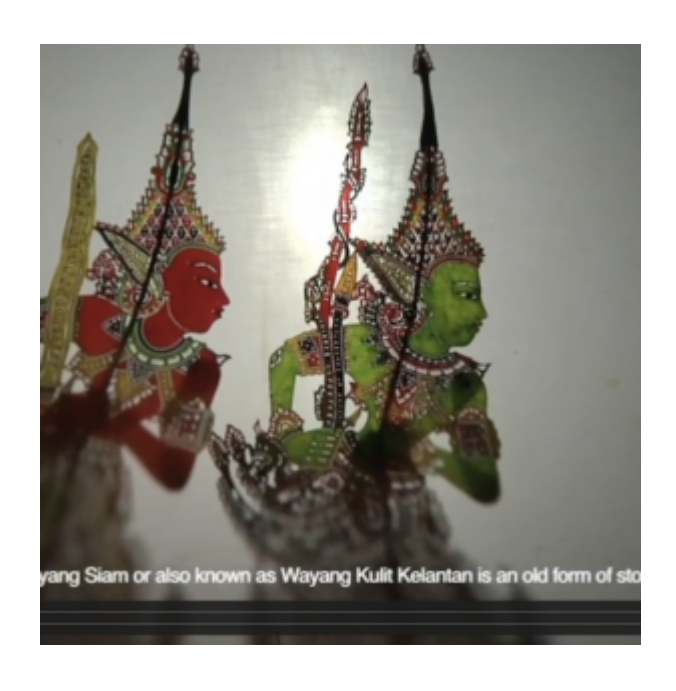
Talking Points: Lotte Reiniger