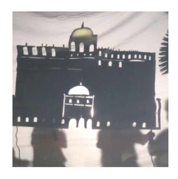
This is featured in the 'Shadow Puppets' pathway