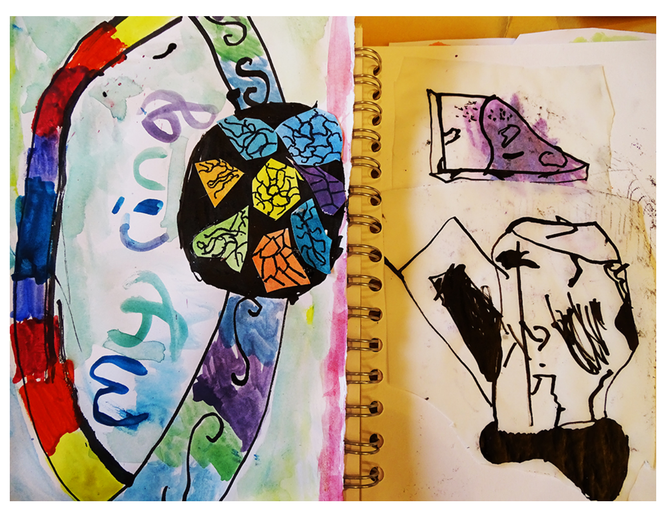
Pink Pig sketchbook exploration

Following on from <u>Drawing with a Ruler</u>, this post shares how children aged 8, 9 and 10 attending an AccessArt Mini Art School developed a body of work in their <u>Pink Pig Sketchbooks</u>.