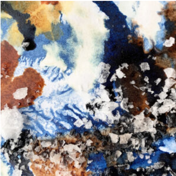
introduction to watercolour