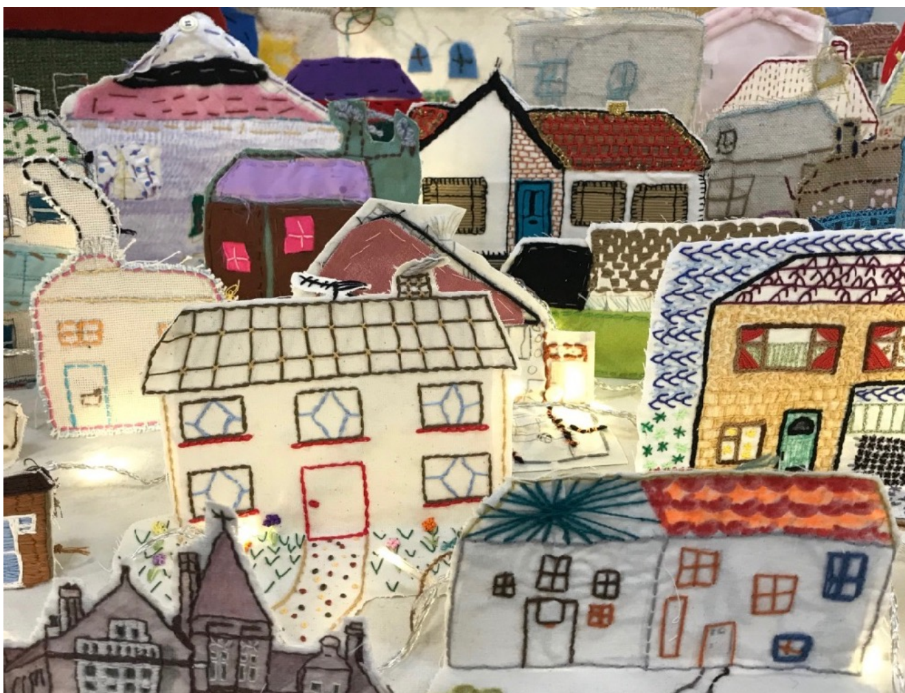
The AccessArt Village at Mansfield Central Library in November and December 2017

You can read more about the AccessArt Village here , but this is the story of one group of children, who generously contributed to the project, and then got a chance to see their work on show, locally to them, in Mansfield Central Library. The pupils stitched work can be seen, in and amongst contributions from all over the country, at Mansfield Central Library until the end of December 2017.