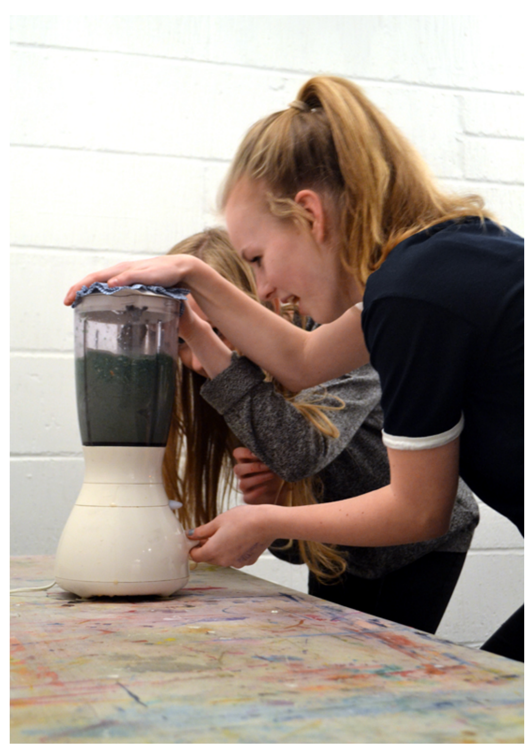
Using an old electric blender to make paper pulp

The energy in the class was electric (literally charged by the electric mixer whirring in the background!) and students loved the tactile experience of playing with water and paper and making paper.