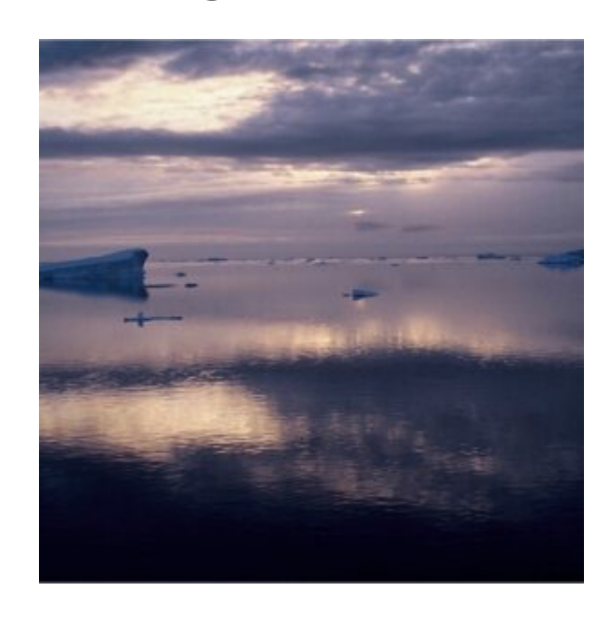
Talking Points: Drawn To Antarctica