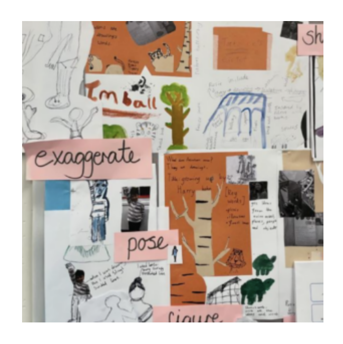
Finger Palette Portraits