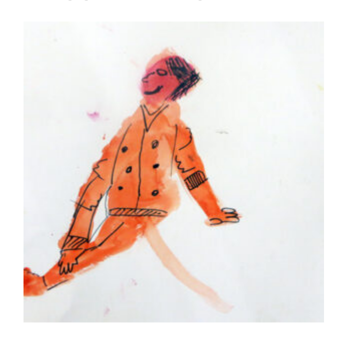
Session Recording: Creating School Exhibitions & Displays