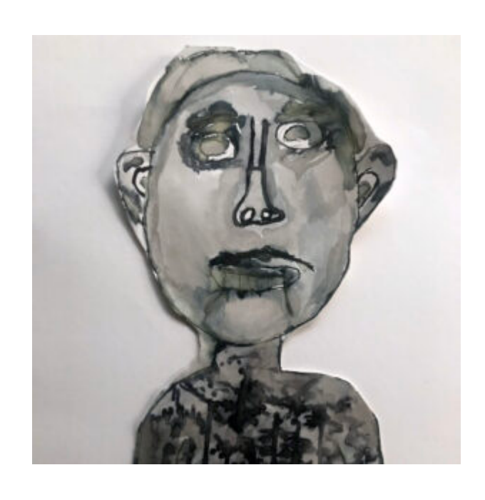
Exploring Macbeth Through Art: Macbeth Portraits