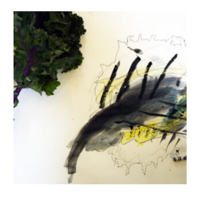
Paint Your corner Shop