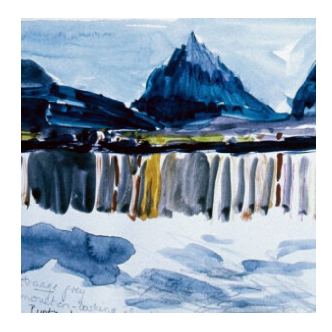
Mini world Lightboxes