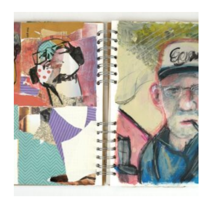
The Sketchbook Journey