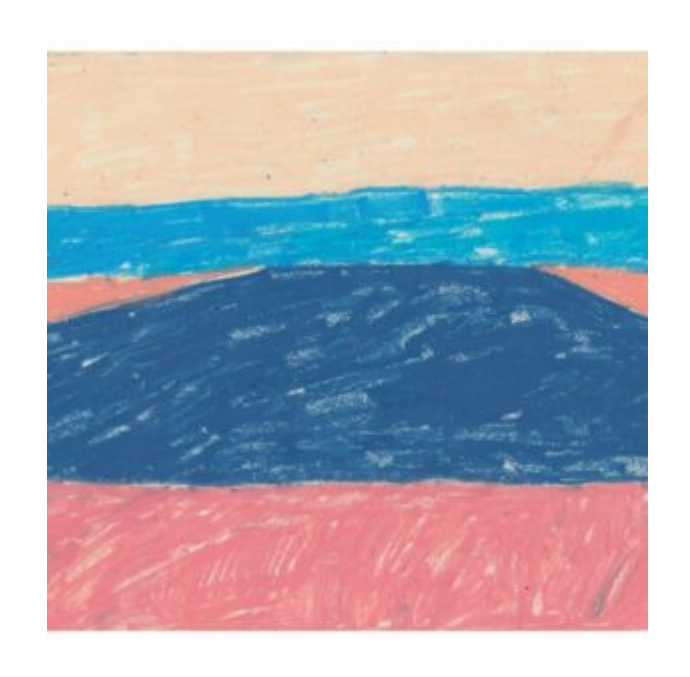
Layered Colour Gestural Drawing

Manipulating Forms in Landscape Painting