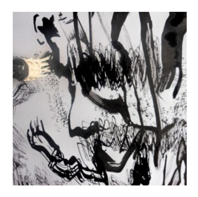
Graphic inky still life