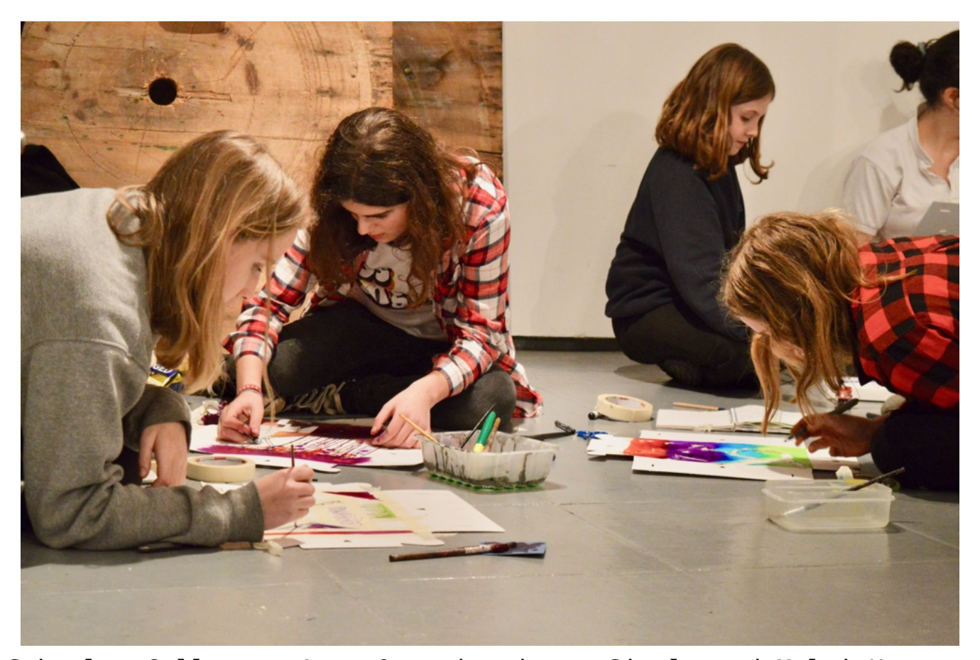
Schools, Colleges, Arts Organisations: Single and Multi-Users From £42

AccessArt is a UK Charity and we believe everyone has the right to be creative. AccessArt provides inspiration to help us all reach our creative potential.