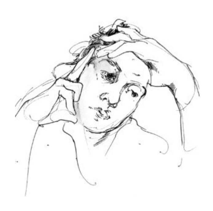
Quentin Blake's Drawings as Inspiration: Exaggerating to communicate