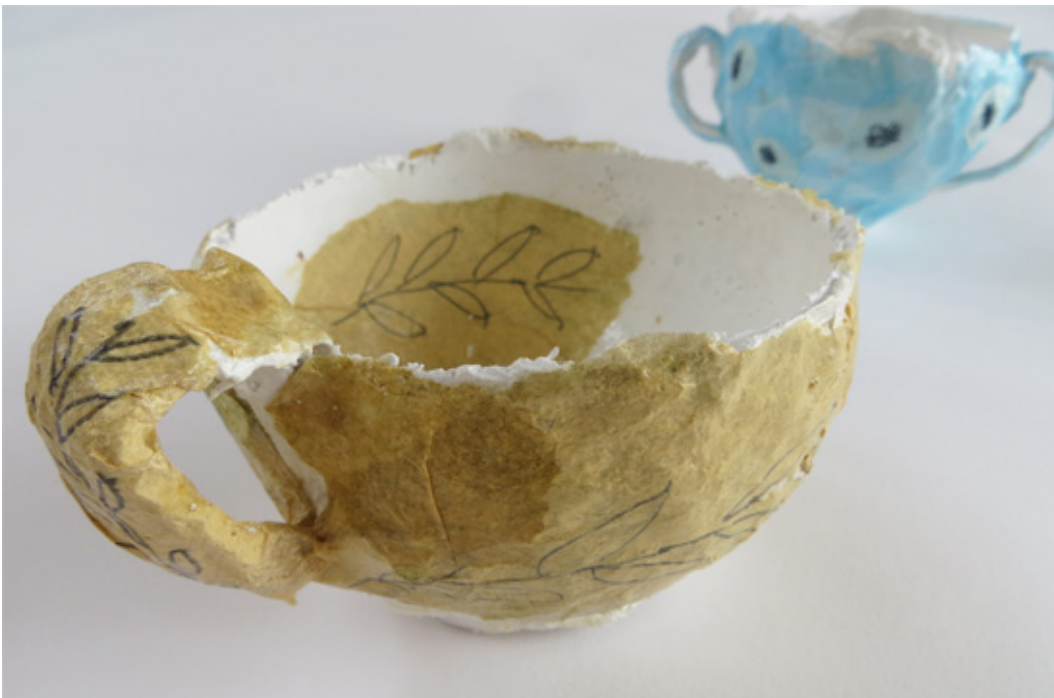
Sculptural Pots - Modroc and paper teacups

An intuitive, construction based method to make sculptural pots using mod roc. Ideal for all ages even the youngest children - right through to adults. The resource also describes how to create pattern on paper to collage over the sculptural pots.