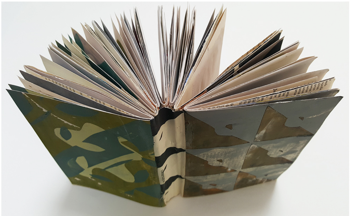
Sketchbook made of screen printed pages

The Screen Printing using Overlaid Pattern resource describes how to make stencils based upon a grid to explore over printing in an intuitive way, resulting in the creation of beautiful patterned sheets. This resource shares how we used these patterned sheets to make a screen print sketchbook.