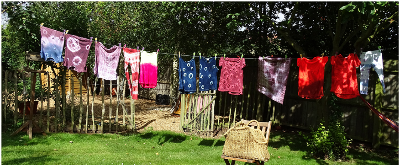
Tie Dye on the line

What better way to spend a summer day than tie dyeing in the garden!