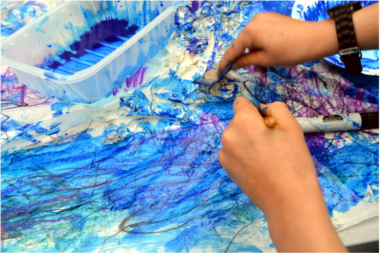
And absolute engagement