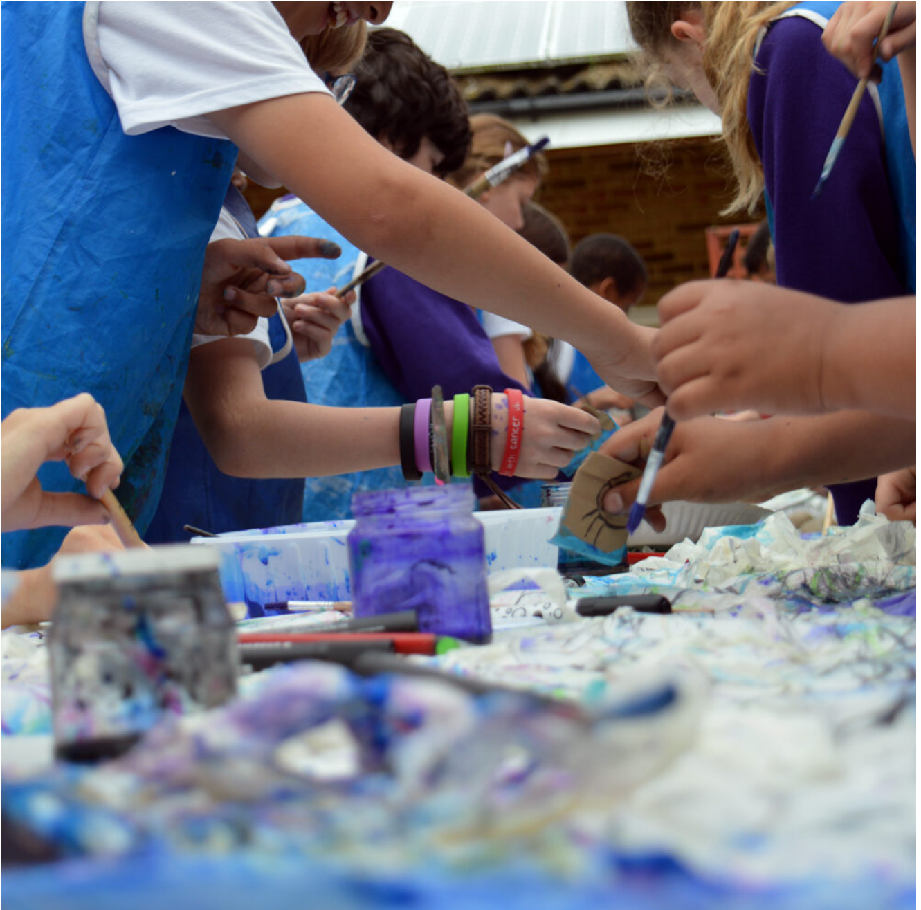
There are moments of sheer joy!