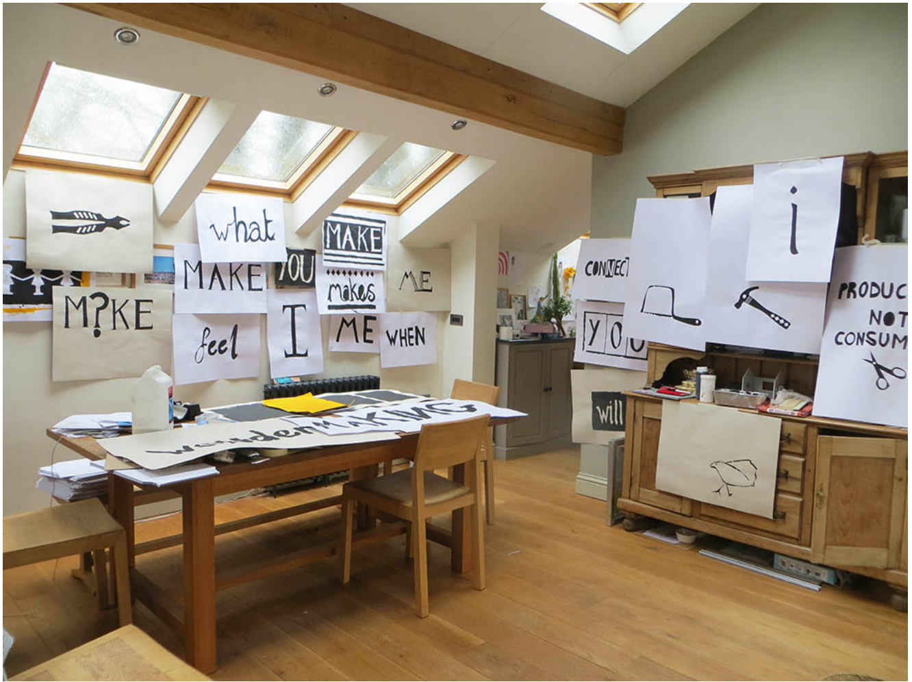
AccessArt office turns into a Campaign Office