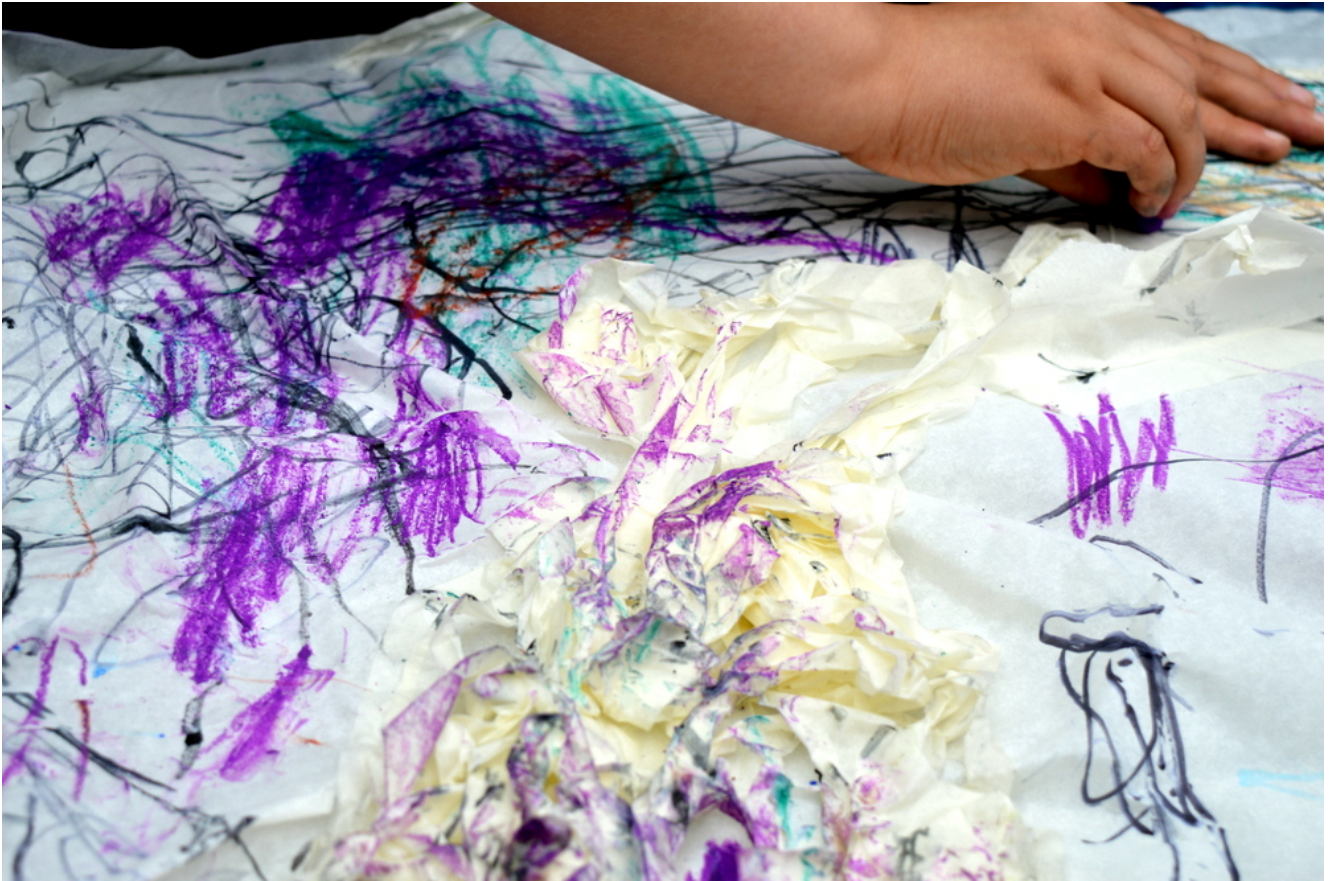
Oil pastels and permanent marker marks over masking tape