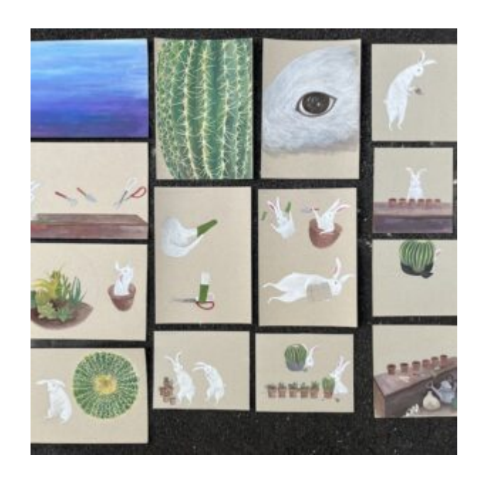
the making of rabbit, cactus, accident