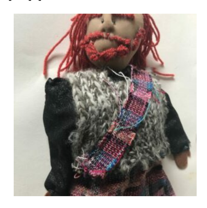
Pop up puppets

Visual Arts Planning Collections: Toys, puppets, dolls