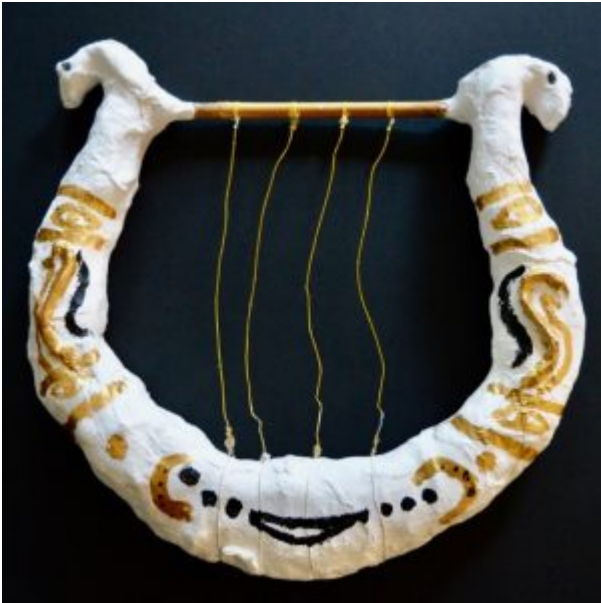
Ancient Greek Lyres