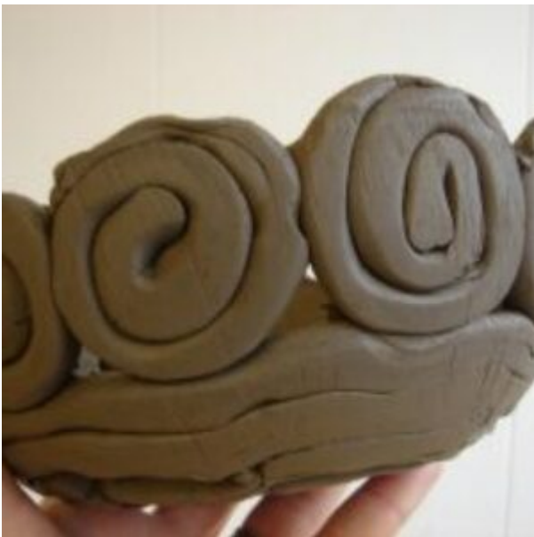
Decorative Coil Clay Pots