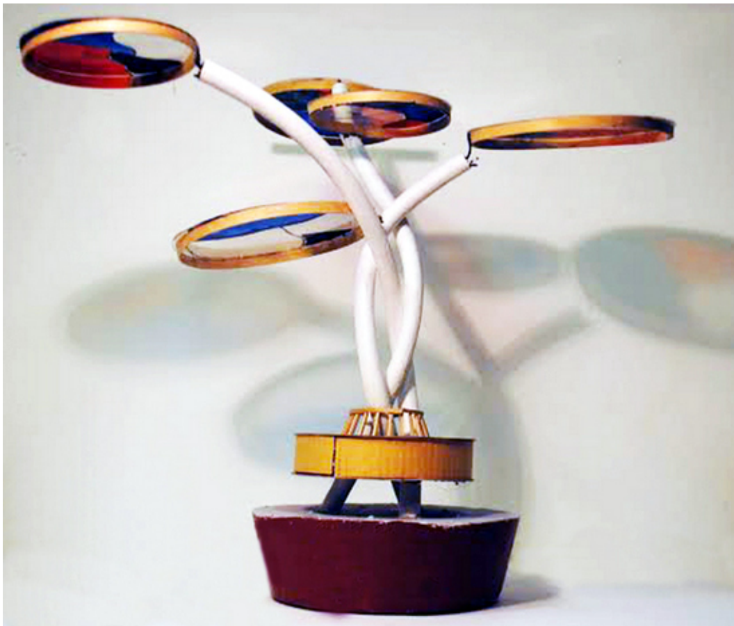
Model of a hypothetical idea

A 40 Artist Educator Resource: Be Inspired by Susie Olczak