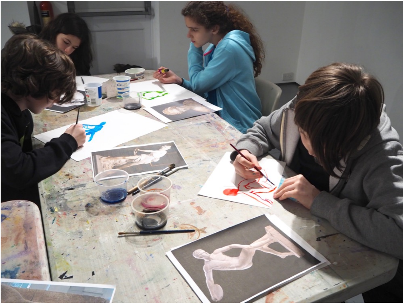
Roman 'Discus Thrower', and Bernini's 'David'.