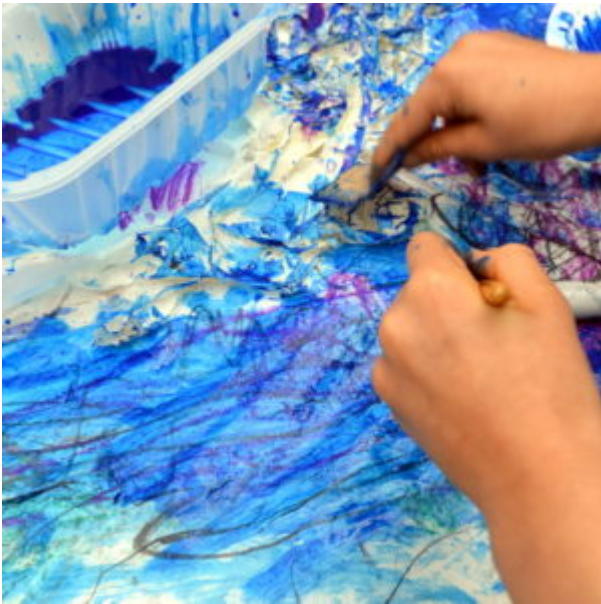
Painting a storm