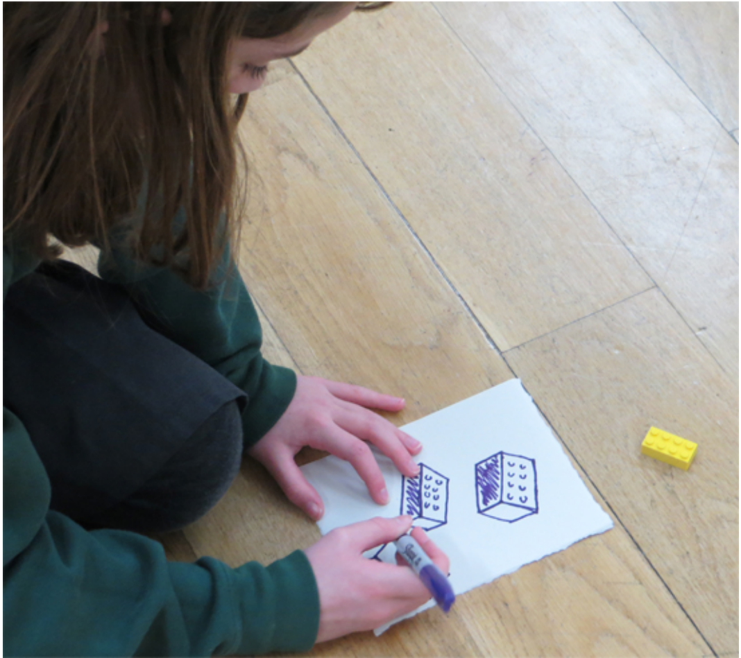
Thinking through perspective by drawing a Lego block