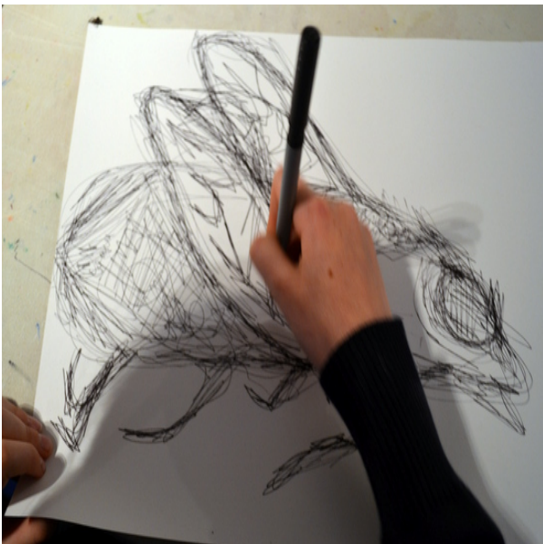
Drawing Insects in Black Pen