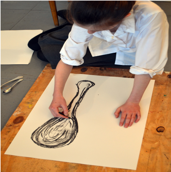
Drawing Shiny Cutlery