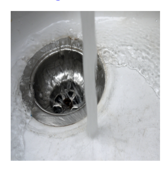
Drawing Pouring Water