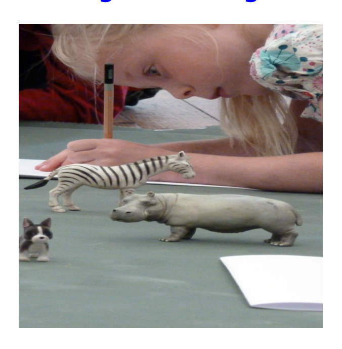
<u>Introducing Foreshortening and Creating</u> <u>Volume</u>