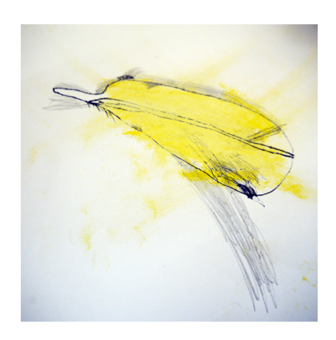
Drawing Feathers: Perfect for Mark Making