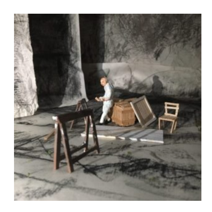
Expressive Charcoal Collage: Coal Mines