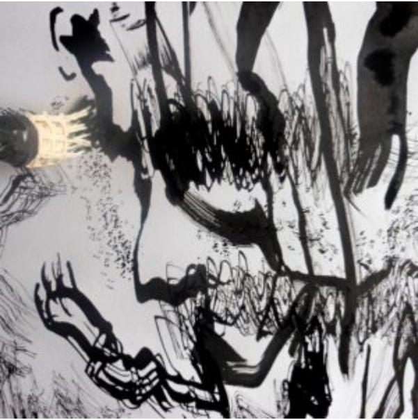
Graphic inky still life